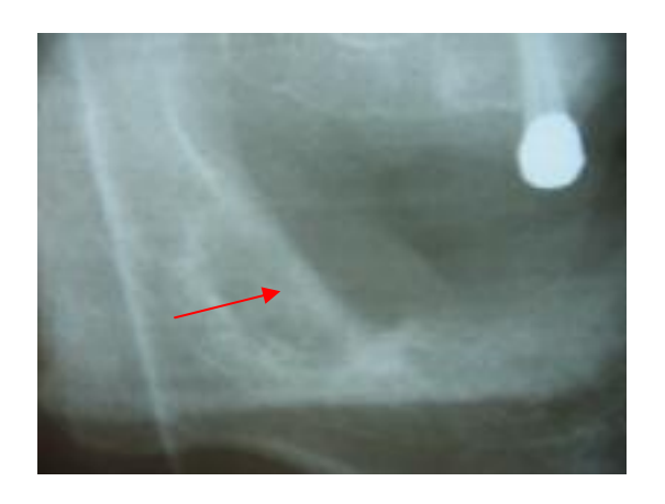
Fig 1: The panoramic radiography of the lesion.

Operation was performed under local anesthesia. Local curettage was then performed in the region of the lesion; the bony cavity was explored for any abnormalities. Routine wound closure was performed. The specimens were sent for immediate microscopic review. A histopathological report confirmed the diagnosis of a CGCG. Patient's postoperative course was uneventful (Fig. 3).