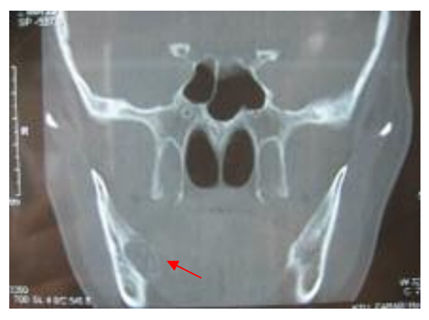
Fig 2: The CT of the lesion.

A 17-year-old, healthy and asymptomatic girl, first seen for routine dental care, was referred to an orthodontist. Dentist noticed a lesion on periapical radiography and sent the patient to our department. In intraoral and extraoral examinations, there was no any clinical finding. Radiographically there was multilocular radiolucency with displacement and resorption of radix of right maxillary central, and the borders were well-defined (Fig. 4). Vitality of the all teeth of the region was normal.