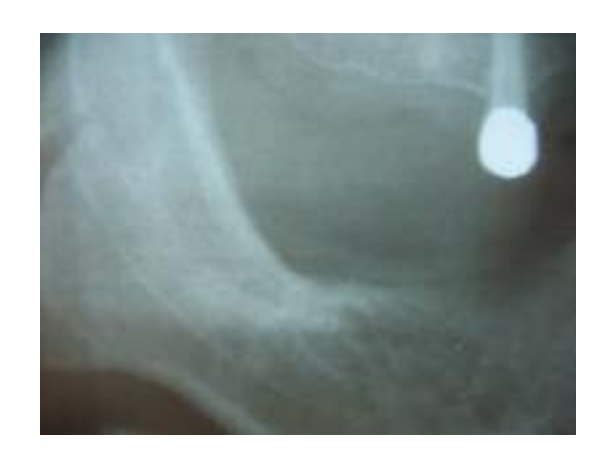
Fig 3: Postoperative 23. months radiography.