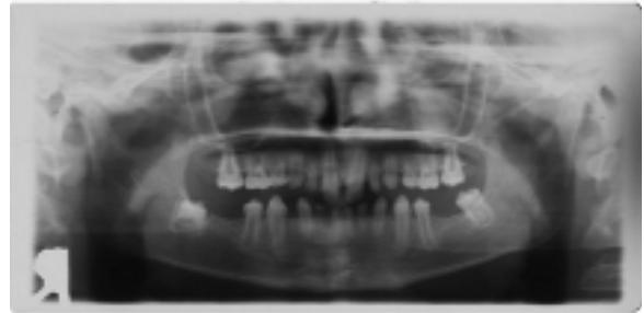
Figure 4 Panoramic radiography of Case 4, 12 permanent teeth are absent.