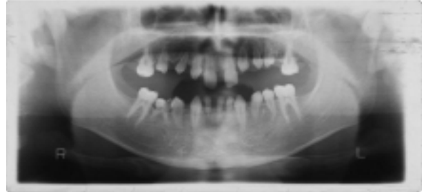
Figure 3 Panoramic radiography of Case 3, 11 permanent teeth are absent.