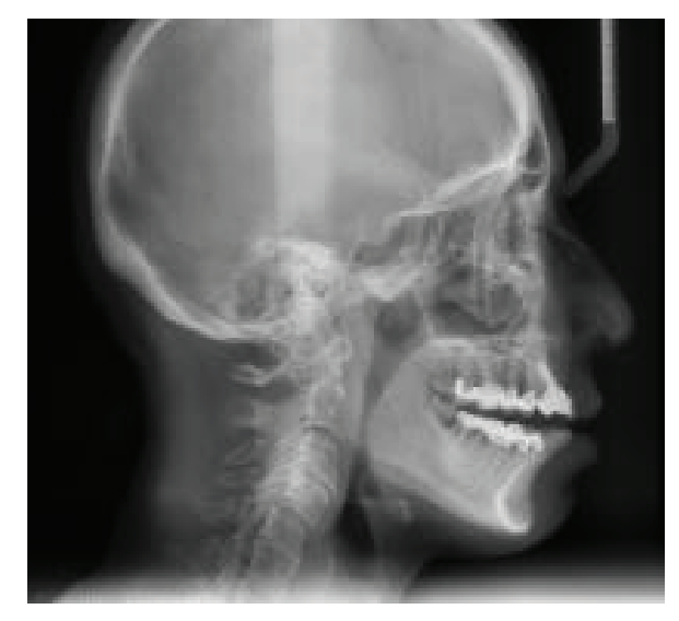
Figure 4: Case 3-Lateral cephalometric imaging with MAD appliance