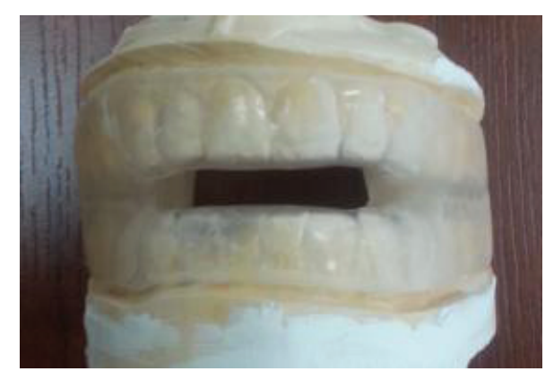
Figure 2: Mandibular and maxillary models and MAD appliance for Case 1

mum amount of protrusion and are positioned anteriorly to the mandible and are called "mandibular advancement devices" (Figure 2-3).