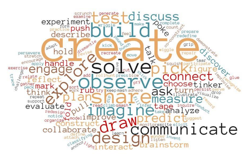
Figure 3. Student action verbs from selected publications with frequency analysis

One aspect of a loose parts mindset is the actions children take when interacting with materials and concepts. Gull et. al (2021) suggest that children apply this loose parts mindset to "build, construct, play, experiment, invent, explore, discover, evaluate, modify, study, think, consider, measure, draw, model-making, calculate, destruct, slide, fold, hide, paint, and bounce" (p. 11). Student action verbs noted (see Figure 3) in the selected articles were extracted and analyzed for frequency. Verbs were standardized for similar endings and repeats were consolidated. Associated nouns in verb phrases were taken out.