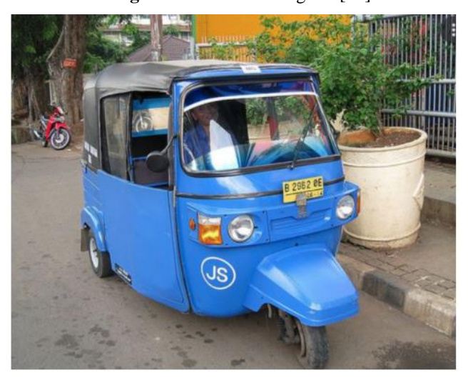
Fig. 2. Bajajs in Jakarta [26].

Regarding literature studies, types of informal transport vehicles are presented as follows in Table 1.