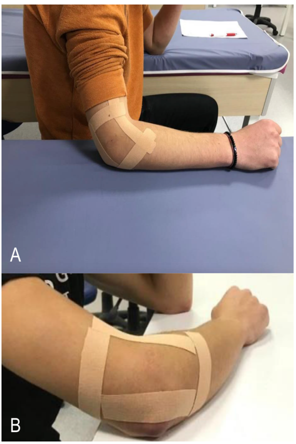
Figure 3. Taping techniques (a: 0% tension, b: intervention group)

The diamond shape technique used four "I tape" (2.5 cm x 12 cm). The middle points of the bands were stretched according to the tension groups' amount of tension. The ends of the tapes overlapped without tension. KT was applied from distal to proximal, exposing the lateral epicondyle area. In 50% Tension Application Group, 12 cm. One centimeter holding margin was measured from the ends of the long "I band". The 10 cm section in the middle was extended by 20% of its length and brought to 12 cm. The ten cm section in the middle was extended 30% of its length and brought to 13 cm in the 75% tension group. In the 100% tension group, the remaining 10 cm was extended to 40% of its length and brought to 14 cm, and then it was taped according to the diamond shape technique. The 0% tension group received the