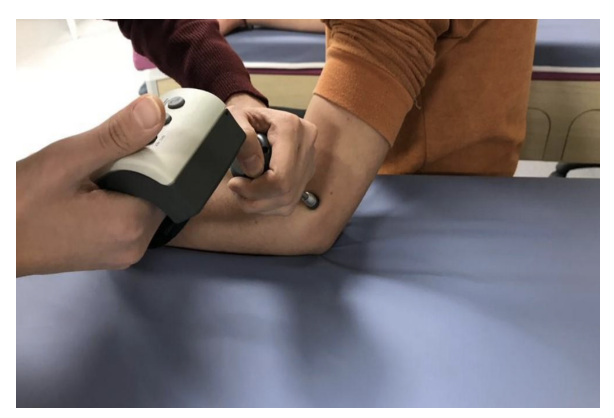
Figure 2. Pressure-pain threshold and pain tolerance assessment

5cm x 5m beige-coloured KinesioTex Gold (NM – GKT15024, Kinesio Holding Corporation, Albuquerque) was used for KT. The diamond shape