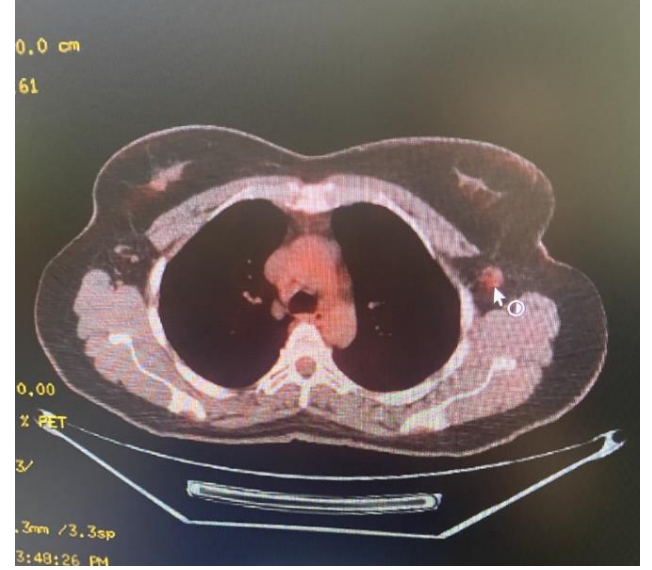
Figure 2. Positron emission tomography-computed tomography examination, a pathological lymph node in the left axillary region