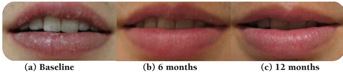
Fig. 2. Timeline of improvement since the commencement of tildrakizumab

response to treatment with tildrakizumab. Cases of atopic cheilitis have previously had effective treatment with topical tacrolimus, however this was ineffective in this case. 2,3 Granulomatous cheilitis, associated with Crohn's Disease has been successfully treated with TNF-alpha inhibitors 4 , integrin \alpha 4\beta 7 inhibitor (vedolizumab) 5 and an interleukin 12/23 inhibitor (ustekinumab) 6 . This is the first documented use of tildrakizumab or an interleukin-23 inhibitor for the successful treatment of idiopathic exfoliative cheilitis leading to a significant improvement in quality of life.