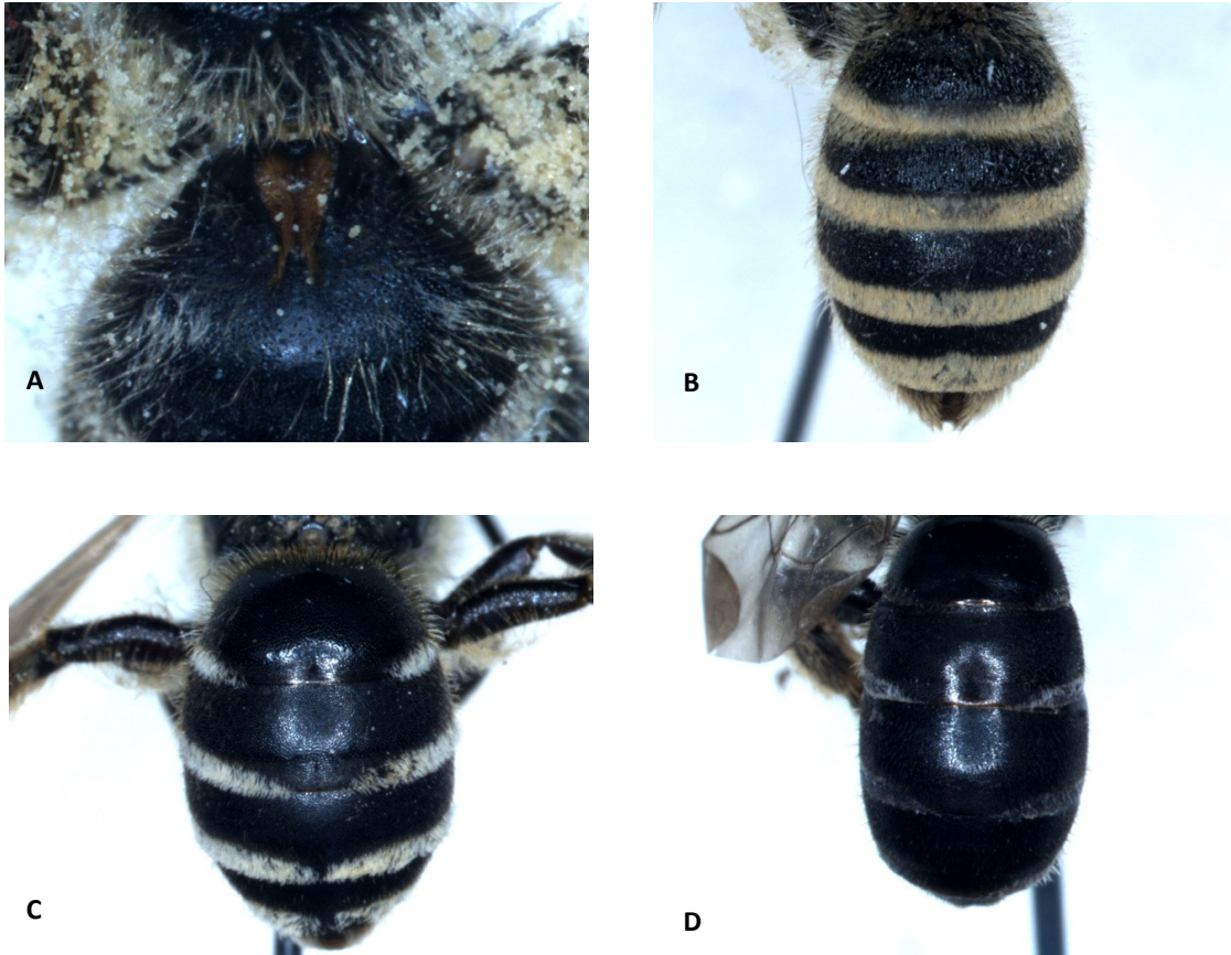
Figure 2. A. Furca-like hairs, H. cochlearitarsis (female). Abdominal terga of B. H. cochlearitarsis (female) C. H. tetrazonianellus (female) D. H. maculatus (female)

study, we determined 12 Halictus species from Beytepe, Ankara and H. grossellus reported for the first time from Ankara. According to studies which were done so far indicate that H. asperulus , H. brunnescens , H. cochlearitarsis , H. quadricinctus , H. maculatus , H. patellatus , H. pentheri , H. sajoii , H. tetrazonianellus , and H. resurgens can be found in every region of Turkey and H. luganicus is distributed in Western part of Turkey [14]. H. grossellus was recorded just from Southeastern Turkey before [14]. Because of that our study suggested its distribution area to be broader than previously known.