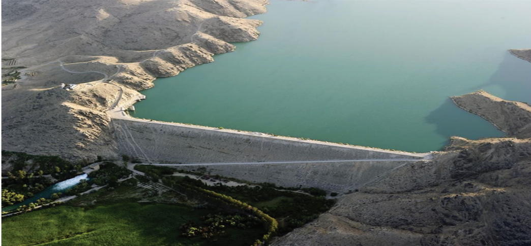
Figure 2: Arghandab Dam, Helmand, Afghanistan

The 44.2-meter (145 feet) Arghandab Dam, 18 miles northeast of Kandahar, was completed in 1952 with a storage capacity of 388,000 acre-feet of water.