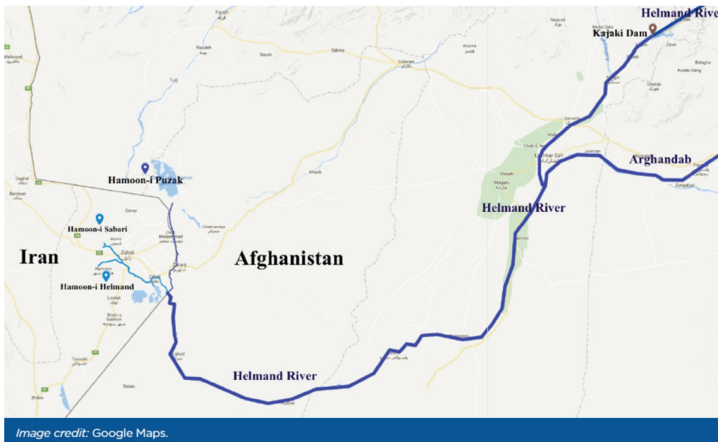
Figure 1: Helmand River on Map

The Helmand River basin is home to more than seven million people. (Dehqan, Palmer and Moloney, 2009: 2)