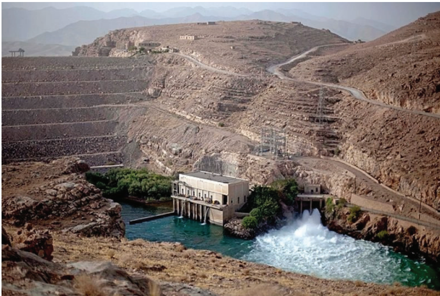
Figure 3: Kajaki Dam, Helmand, Afghanistan

A few months later, in April 1953, the Kajaki Dam, seventy-two miles upstream from Lashkar Gah, was also finished. It created the most important water reservoir in Afghanistan and was built with the objective of providing electricity, water for irrigation, and flood control. As with the Arghandab Dam, appropriate soil and topography studies were not conducted, even though a 1950 United Nations report had cast doubt on the economic soundness of the project and predicted negative environmental effects in the lower valley, including water logging and salinization downstream from the dam. (Whitney, 2006: 23-27) The Impact of the Kajaki Dam has been mixed, since it increased water flow to Iran during the dry season but reduced the flood waters on which pastoralists depend for fertilization (Weinthal, Troell ve Nakayama, 2014). Nevertheless, it is obvious that without the 1973 agreement, the situation would have been much more complicated.