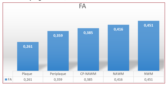
Graph 1: Graph of mean FA values measured in MS patients and control group

peri plaque, CP-NAWM, NAWM and control group NWM FA were compared in MS patients; value of the plaque FA (0.261±0.113) was the lowest. Other FA values increased in the following order: peri plaque (0.359±0.115.), CP-NAWM (mean FA 0.385±0.120), NAWM (mean FA 0.416±0.082), and NWM (mean FA 0.451±0.098). The difference between the mean FA values of plaque, periplaque, CP-NAWM, NAWM and control group NWM in MS patients is shown graphically ( Graph 1 ). In our study, the difference between plaque (p<0.001), peri-plaque (p<0.001), CP-NAWM (p<0.001), NAWM (p<0.001) and NWM FA (p<0.001) values was statistically significant ( Table 1 ).