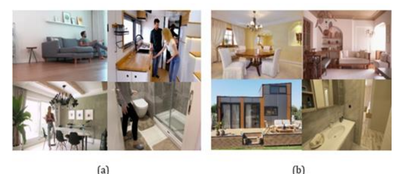
Figure 2. (a) Images containing human figures, (b) images without human figures obtained from social media platforms

The REP data set was separated into Training, Validation, and Test data for use in DL architectures. 70%, 20%, and %10 of the dataset is reserved for training, validation, and testing, respectively. The number of training data is shown in Table 2.