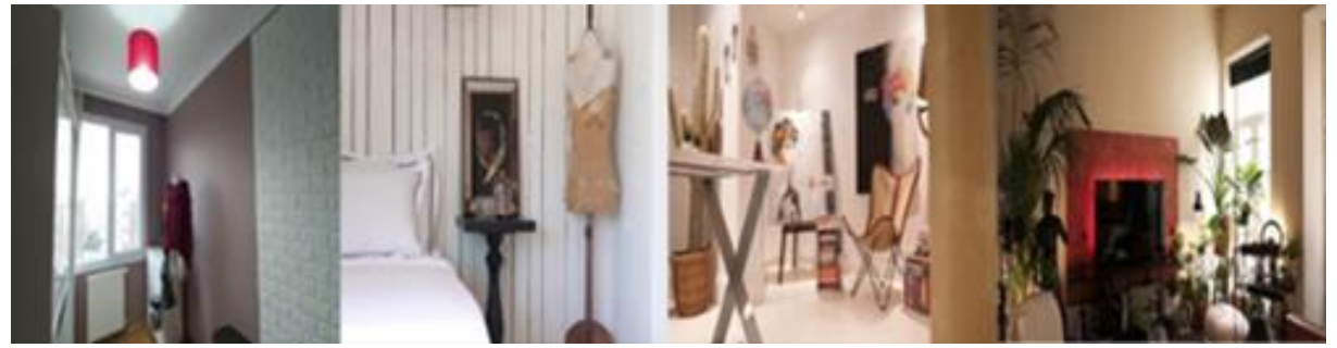
Figure 4. Examples of incorrect (FP) prediction images

Investigations on false positive images revealed that does not contain a real person and contain human-like materials such as a painting with human figures, plastic mannequins, and sculptures and these images were misclassified by the models. If the misclassified images are removed from the model, there will be no effect on the accuracy of the classification. Because the model will encounter these images in the training process, it will not be able to learn that they are non-human images. If the number of similar images in the dataset is increased, the problem may be solved.