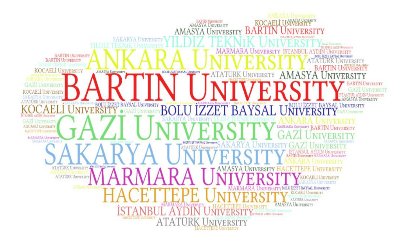
Figure 3 Cloud of Density of Universities Where Theses Are Made

When universities are examined, it is seen that the most theses were written in Bartın University with 31 theses. As a result of the research, it is seen that there is a lifelong learning department at Bartın University. We can say that the fact that it is the university where the most theses about lifelong learning is written is an indication that it is effective in this situation. It is seen that 21 theses were written in Sakarya University, which ranks second after Bartın University. It is seen that Gazi University has 11 theses in the 3rd rank. The reason why Gazi University is the 3rd most written university about lifelong learning in Turkey brings to mind the fact that it has a deep-rooted educational background.