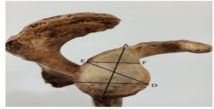
Figure 1. AB: Superio-Inferior Glenoid Diameter (SIGD), CD: Anterio-Posterior Glenoid Diameter 1 (APG1), EF: Anterio-Posterior Glenoid Diameter 2 (APG2), ED: Anterio-Posterior Glenoid Diameter 3 (APG3)