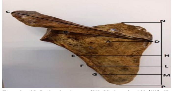
Figure 3.a. AD: Basis-spina distance (BS), BD: Scapula width (SW), CD: Spina scapula width (SSW), GM: Scapula margo medialis length 1 (SML1) FL: Scapula margo medialis length 2 (SML2), EH: Scapula margo medialis length 3 (SML3), NP: Scapula length (SL)