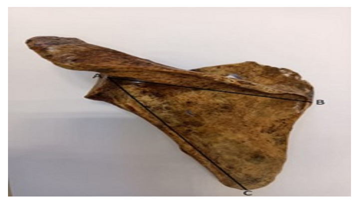
Figure 3.b. AB: Maximum scapula width (MSW), AC: Scapula margo lateralis length (SML)