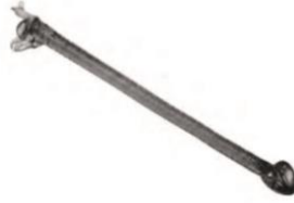
Photo 3: Glass Rod Used as Dropper (Facsady, 2008, p. 166, Fig. 2).