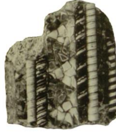
Photo 9: Glass Rods Used in Architectural Decoration (Goldstein, 1989, p. 263, No. 791).