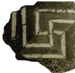
Photo 8: Glass Rods Used in Architectural Decoration (Goldstein, 1989, p. 263, No. 790).