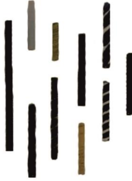
Photo 11: Romano-Italian Cast Architectural Decorations (Grose, 1989, p. 349, Fig. 670 a-j).