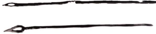
Photo 6: Glass Rods Used as Stylus (Akat et al., 1984, Fig. 18, No. 51a-b).