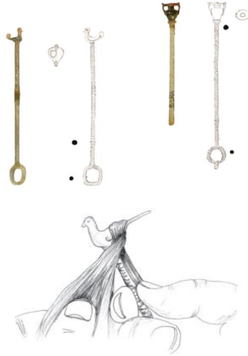
Photo 12: Glass Rod Used as a Distaff (Petcu and Petcu-Levei, 2022, pp. 181-184, Cat. No. 1, 4, 6)