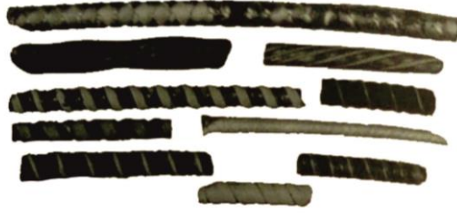
Photo 10: Glass Rods Used in Architectural Decoration (Goldstein, 1989, p. 246, No. 720).