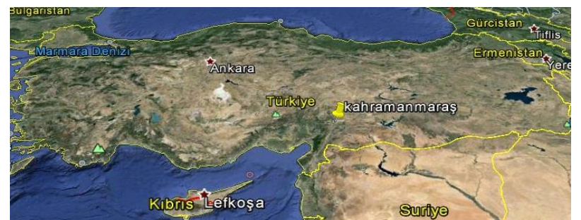
Figure 1. Location of Study Area on Satellite Image

Kahramanmaras whose great part occupies in northeast of the mediterranean region located in transition area which is betwen mediterranean climate and continental climate (Figure 1). But mediterranean climate is more dominant than the other in the city (Korkmaz, 2001). The study area reflects certain characteristics of Mediterranean climate with average annual precipitation of slightly over 700 mm, and precipitation is usually seen in winter and spring seasons in the region. The average annual temperatures is 16.7 °C, while maximum and minimum temperatures are 45.2 °C (July) and –9.6 °C (February), respectively (DMİ, 2010). Kahramanmaras has (C2 B'3 s2 b'3) sub-humid, mesothermal with third degree, large summer water deficiency and near maritime condition climate type according to Thornthwaite climate classification. In the study area, forest ecosystem, bare areas, shrubs areas, grasslands and agricultural systems (fallowing and plantation) exist dominantly.