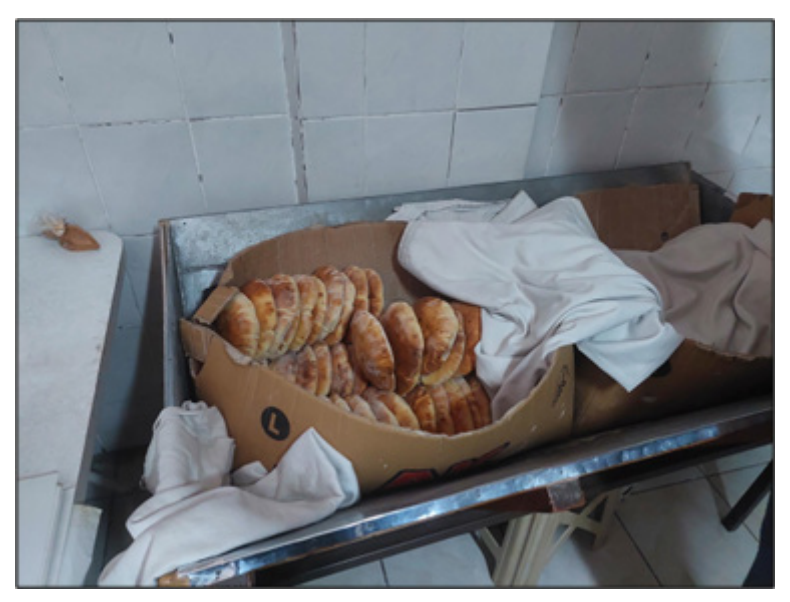
Photograph 5. Appearance of Karahöyük Bread

The most important feature of bread is that it is made with chickpea flour as well as wheat flour, and chickpea yeast is also used. It is chickpeas that give bread its aroma, which makes it different from other breads. It is also known that this bread, which is also known as kebab bread among the people of the district, is sold in Karahöyük Bazaar with roasting and tas kebab. This bread, which the shepherds ate while grazing animals, was preferred by the people.