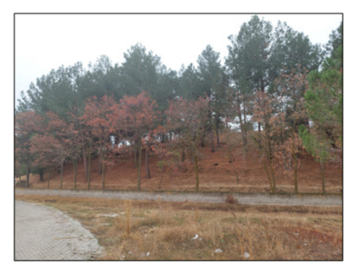
Photograph 2. View from the Mound in Karahöyük District

and walnut are among the other agricultural products produced. (Cirit, 2019). Karahöyük Neighborhood, located in Acpayam district, takes its name from the mound located in the southwest of the district (Photograph 2). While the tombs of the local people have been found on the mound for the last 10 years, there has been no burial in this region for 10 years.