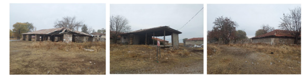
Photograph 4. A View of the Historical Karahöyük Market Today

According to Atalay, the hinterland of the market has been very wide since it was first established. It is known that there were people coming to the market from Burdur, Antalya, Afyonkarahisar, Aydn, and Mula. In the marketplace, just like in Kaleiçi Bazaar, a group of artisans in the same profession were selling together (drafters, cutlery, saddle sellers, etc.) (Atalay, 2007). Today, the bazaar, which is no longer used, has become a place consisting only of the ruins that the local people keep alive in their memories as far as they heard from their elders (Photograph 4).