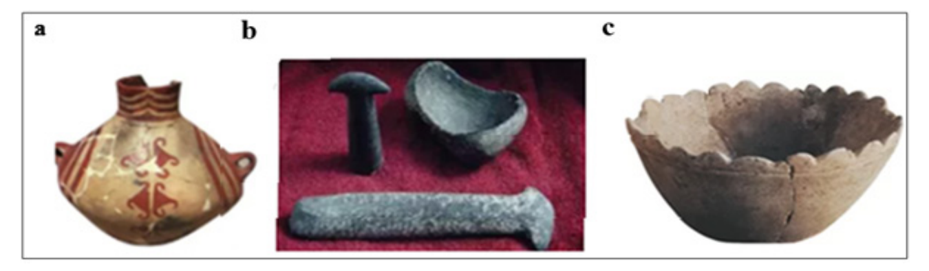
Photograph 1. Artifacts from Çatalhöyük (a) Neolithic Pottery (b) Mortar Used for Beating Grain (c) Clay