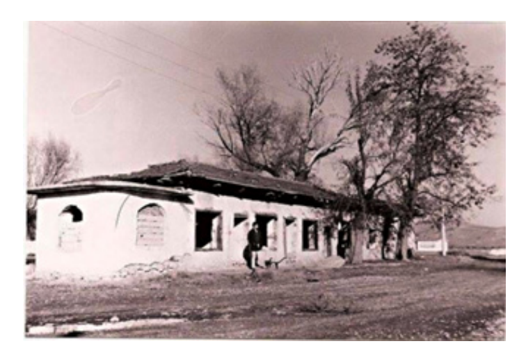
Photograph 3. Karahöyük Market Karahöyük Market in 1970