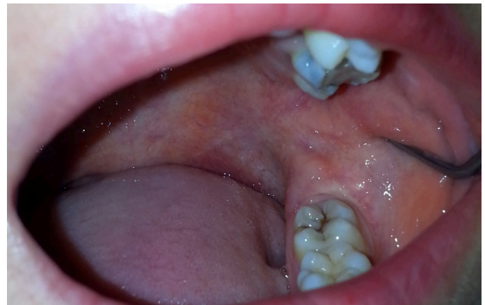
Figure 2. Preoperative intraoral picture of the lesion area. There was no intraoral findings including swelling or pus drainage.