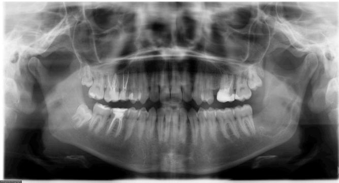
Figure 4. Panoramic radiograph of the patient four months after marsupialization.