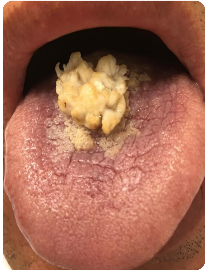
Fig. 1. Large wart on the midline of the tongue.

A 68-year-old male patient was referred to the dermatology clinic due to an asymptomatic whitish, painless papillomatous lesion on his tongue that was detected coincidentally during examination to assess his eligibility to be a kidney donor. The patient admitted the lesion developed 15 years ago as a small papule and enlarged progressively and he did not seek medical attention. His medical history was insignificant, and he was a heavy smoker for 40 years. Dermatological examination revealed an approximately 2 cm \times 2 cm in size, white, solitary papillomatosis polypoid lesion on the midline of the tongue (Fig. 1). Oral cavity or extraoral regions were exempt from similar lesions. The lesion was excised, and a pathological examination was performed. The pathology revealed a benign papillomatous lesion consistent with VV. Histopathological examination showed that finger-like papillomatous projections lined by hyperkeratotic stratified squamous epithelium. Intracorneal hemorrhage was seen in some areas. The epithelium showed areas of parakeratosis, hypergranulosis and focal koilocytotic changes (Fig. 2).