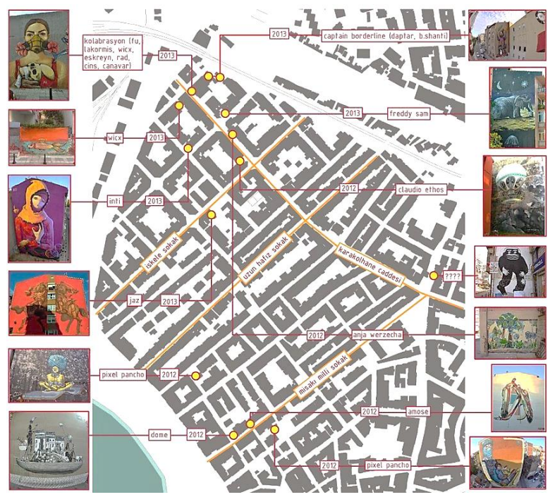
Figure 3. Mural Istanbul Map [22]

The realization of this artistic movement in the region, which was open to the public and was approved by higher institutions, has begun to change the perspective of the residents of the neighborhood towards the "rebel" spirit of street art. The fact that the residents and users of the region witnessed the long construction phase of the works contributed to their internalization of the giant paintings on display. It can be said that the qualification of the works with the concept of "festival" has caused people to perceive the works positively and to think that they will feel good and reach a result that they will be satisfied with.