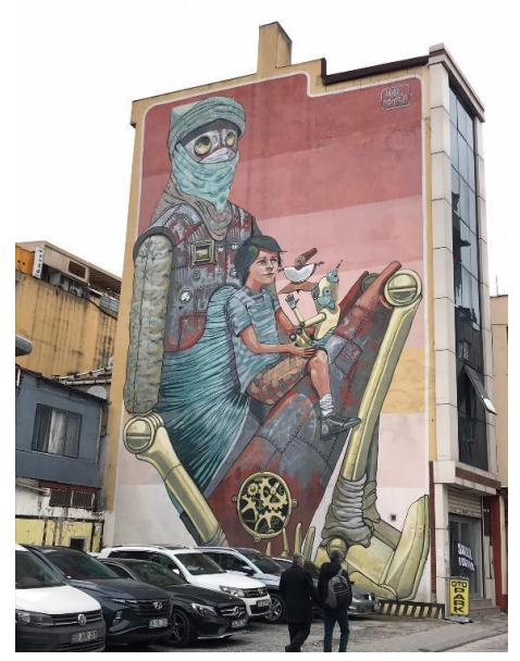
Figure 7. Bambino, Pixel Pancho, [Özer]