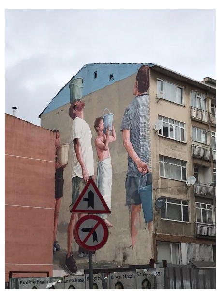
Figure 6. People praying for rain, Fintan Magee, [Ozer]