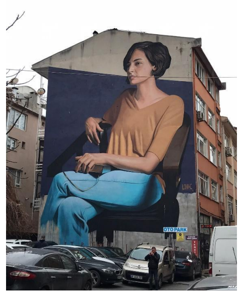
Figure 5. Sitting Woman, Lonac, Mural-Ist 2018, [Özer]