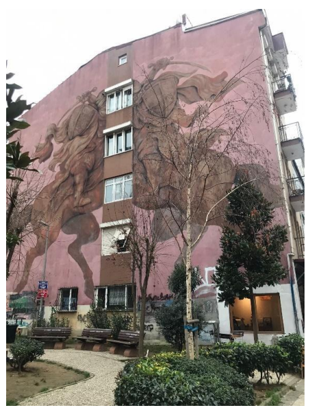
Figure 4. One Against One, Jaz, Mural-Ist 2013 [Özer]