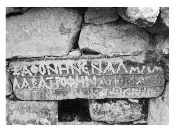
FIG. 22 Fragment of a liturgical text found in Dümrek, photo by H. Güney.

Commentary: This fragment and no. 14 bear liturgical texts from the Greek version of the book of Psalms and in Byzantine prayers. Letter shapes indicate a date in the Middle Byzantine period (7th-11th centuries). Line