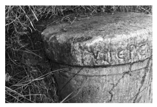
FIG. 8 Votive column found in Beyyazı, photo by H. Güney.