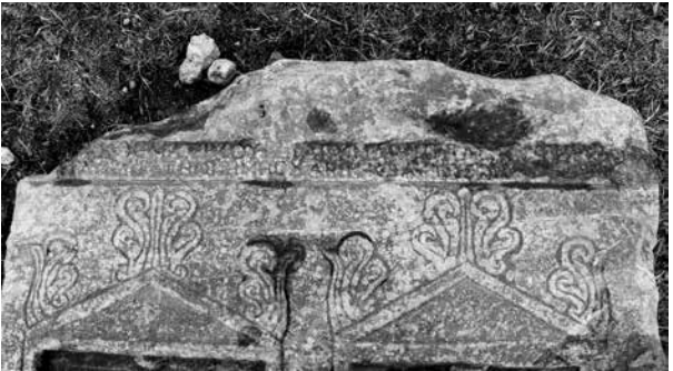
FIG. 5 Detail. Epitaph found in Sadıroğlu.

women with carding/weaving tools and men with agricultural tools. It is known that the men were also presented as literate through depictions of scrolls, tablets, and styluses, while the women were attentive to personal grooming through depictions of perfume, combs, sandals, cosmetic vessels, and mirrors.<sup>32</sup>