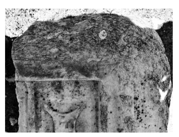
FIG. 12 Epitaph found in Beyyazı, photo by H. Güney.

Commentary: This fragment belongs to a doorstone monument. It seems that many funerary monuments were used in the tekke as spolia. Perhaps the area was first used as a Roman necropolis and later as a tekke including Muslim graves. Crystalized marble stone seems to have dissolved over time due to weather conditions. The fragment may be read as oi \pi o\lambda \tilde{t} \alpha i or in the accusative / dative case, referring to the citizens/compatriots. The village of Ahiler must have belonged to the territory of Pessinus in the Roman period.