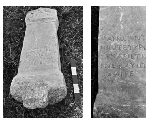
FIG. 20 Epitaph found in Dümrek