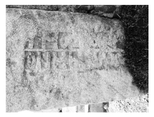
FIG. 23 Fragment of a liturgical text found in Dümrek, photo by H. Güney.

Commentary: See no. 13. It is difficult to suggest anything specific, but perhaps it is related to the phrase \epsilon i \sigma \eta \gamma \alpha \gamma \sigma \nu \alpha \dot{\nu} \tau \dot{\rho} \dot{\epsilon} c \tilde{\epsilon} \sigma \tilde{\epsilon} v \mu \eta \tau \rho \dot{\epsilon} c found in Song of Songs and often commented on by Christian writers.<sup>49</sup>