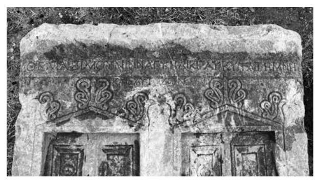
FIG. 7 Detail. Epitaph found in Sadıroğlu.