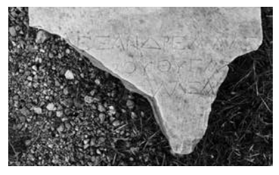
FIG. 17 Detail. Epitaph found in Dümrek.

Commentary : Alexandrea could be either in the dative or the nominative case. The correct form in Greek is Ἀλεξάνδρεια. It must be nominative here since the formula starts with the name of the commemorator and then the name of the commemorated. The patronym could be a common name in the region – Agathemeros.<sup>41</sup> Thus, it must be Ἀγαθημέρου in lines 1-2. There are two alphas in line 1. The engraver perhaps mistakenly carved two alphas for the name Agathemeros. As seen in line 3, the name Alexandros is also missing an epsilon.