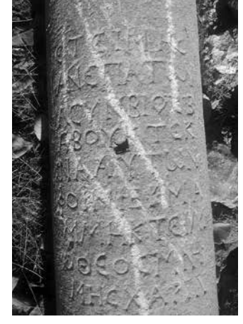
FIG. 14 Detail. Epitaph found in İğdecik.