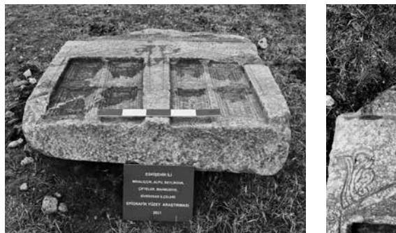
FIG. 4 Epitaph found in Sadıroğlu, photo by H. Güney.