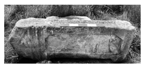
FIG. 10 Epitaph found in Beyyazı, photo by H. Güney.