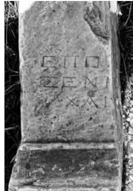
FIG. 18 Epitaph found in Dümrek, photo by H. Güney.