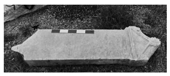
FIG. 16 Epitaph found in Dümrek