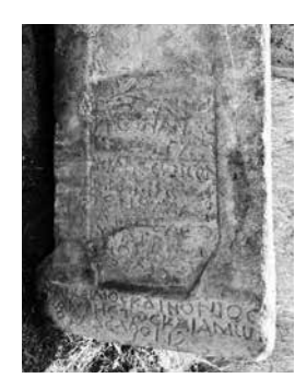
FIG. 11 Detail. Epitaph found in Beyyazı.