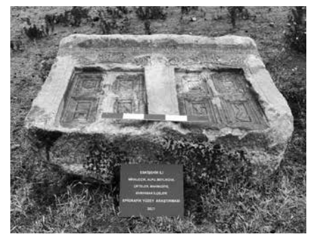
FIG. 6 Epitaph found in Sadıroğlu, photo by H. Güney.

Commentary: see no. 3. Ninna is a Lallname found in Galatia and Cappadocia.<sup>33</sup>