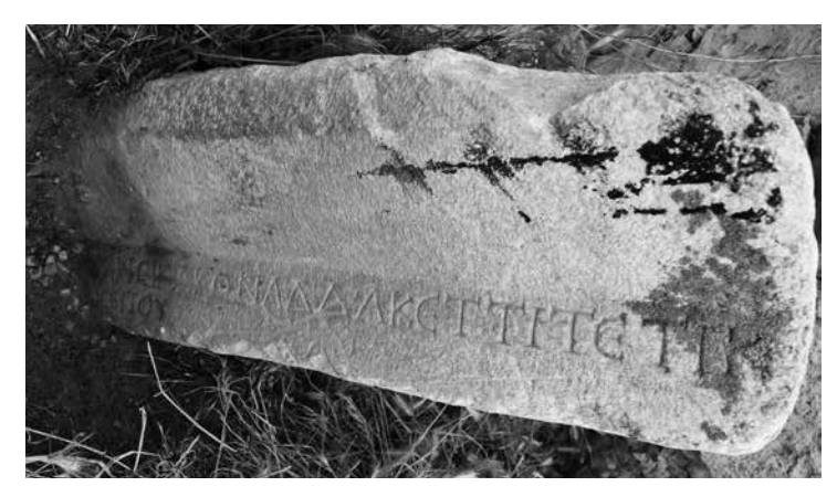
FIG. 3 Phrygian curse inscription found in Doğanay

Translation .... whoever does harm to this tomb, let him become accursed.