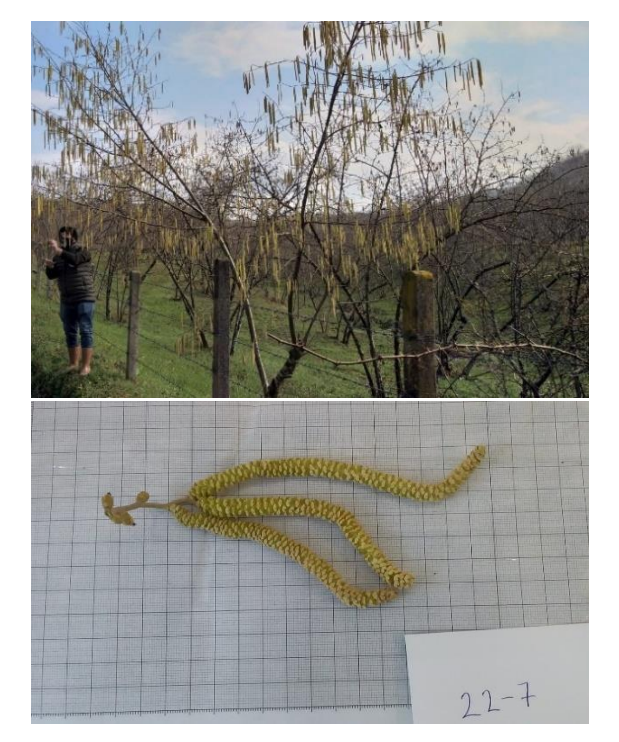
Figure 3. Plant and catkins image of pollinator genotypes

Male inflorescences in hazelnuts begin to appear on the ends and sides of seasonal shoots in July. There are 150-200 male flowers in catkins. On the other hand, more than one catkin may form from one bud. There are 4 male organs in each bract leaf of catkins. There are 2 anthers in each of the male organs. Cross pollination is required for high nut set in hazelnut. At least two pollinator cultivars are recommended. Pollinators should not show incompatibility, produce a large number of catkins, pollen viability should be high, pollen shading should be as long as possible (Hampson et al., 1992). In our study, it was observed that although the genotypes were grown in different ecological conditions, they formed quite a lot of catkins depending on the plant age and tree volume (Figure 3). However, the fact that these genotypes have a high amount of catkins does not mean that they are ideal pollinators.