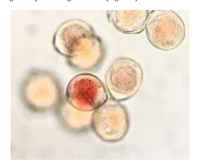
Figure 1. Pollen viability test in hazelnut (viable pollen and dead pollen).

In the selection of genotypes, it was taken as a criterion that the male flowering was later than the standard cultivars. Since January 2022, phenology has been followed in both districts on the basis of cultivar and altitude, and genotypes that still continue to bloom after the end of male flowering in standard cultivars have been determined. Catkins were taken from the genotypes and viability and germination tests were performed on the pollen obtained after they were kept at room temperature for 24 hours. While 2, 3, 5,-Triphenyl Tetrazolium Chloride (TTC) method was applied in pollen viability test (Figure 1), pollen germination was determined at 20% sucrose concentration containing 1% agar compared to agar method (Figure 2).