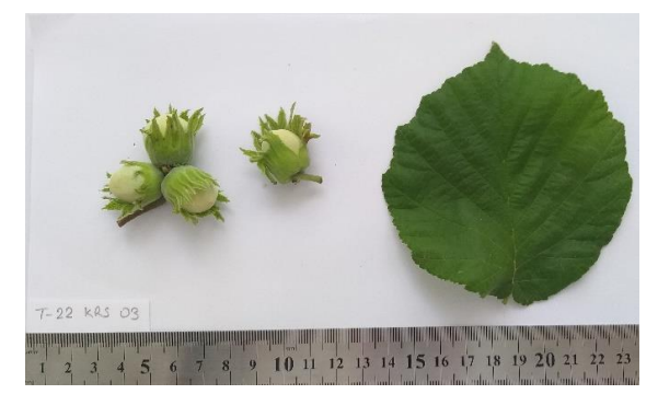
Figure 5. Husk image of pollinator genotypes BSJ Agri / Hüseyin İrfan BALIK et al.

Husk image of pollinator genotypes is presented in Figure 5. The husk length in hazelnut was compared with the nut and grouped into three categories as shorter than the nut, equal to the nut and longer than the nut (UPOV, 2022). While the husk length was longer than the nut in 17 of the genotypes examined, it was determined that the husk and nut were equal in length in 5 genotypes, and the husk length was shorter than the nut in 5 genotypes. It is seen that the cultivars grown especially in countries where mechanical harvesting is applied have a short and loose husk structure that surrounds the nut. Turkish hazelnut cultivars, especially due to the topographic structure of the Eastern Black Sea Region, where they were cultivated for the first time, have resulted in the surviving of the varieties in which the husk is long and tightly wraps the nut, as a result of a conscious selection (Balık et al., 2021).