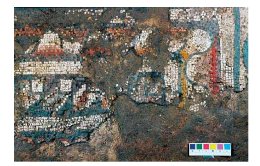
Figure 9 Detail of the three-dimensional decoration on the Bracara Auguta mosaic.

The plastic cubes as a pattern appear on mosaic pavements from the 2<sup>nd</sup> century B.C. onwards (Ovadiah 1980: 160, 55 K3). In the «Casa dei Grifi», Rome, Palatine, 100 B.C., a panel in opus sectile and the low part of the mural painting are associated by the same decoration: three-dimensional parallelepipeds. At Pompeii, the oldest example of that sort of painting comes from the 1<sup>st</sup> Style (Barbet 1985: 29-30 fig. 18: «Casa dei Grifi», central cubiculum , n° II; fig. 17: Pompeii, house VI, 16, 26).