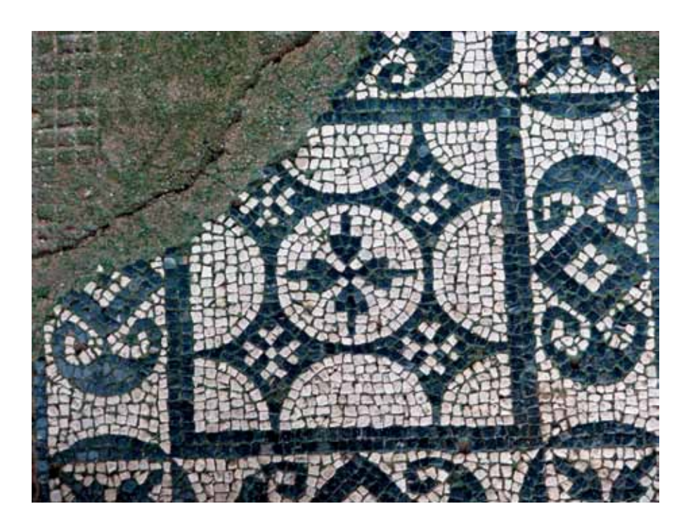
Figure 1 Detail of the peristylum mosaic from "Casa del Mitreo", Mérida, with the «compass drawing schema» filling a square.

As regards the Western provinces of Hispania (Tarraconensis, Baetica and Lusitania) the earliest examples of floors with this compositional schema date from the 2<sup>nd</sup> century A.D.<sup>6</sup>. In the capital of Lusitania , colonia Augusta Emerita, we found this schema curiously used in filling up small squares as in the peristylum mosaic of the so called «Casa del Mitreo» (Fernandez-Galiano 1980: 45) (Fig. 1), dated from the end of the 2<sup>nd</sup> century A.D. (CME I: 39-40, n° 21, láms. 44 b and 45 a (mosaic from the 2<sup>nd</sup> century A.D.). Id. Ib . Introduction: 15-16). It seems rare use since this schema is usually used in relatively large panels inserted in the decoration of all floor or even covering the entire mosaic pavement. Such is the case of the mosaic also proceeding from the capital of Lusitania, signed by Seleucus and Anthus<sup>7</sup>, mosaicists names pointing to the Hellenistic East, particularly to Syria as the name Seleucus <sup>8</sup>.