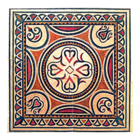
Figure 4 Drawing of the mosaic pavement J, N° 3-B from the Villa of Boca do Rio, Budens, Vila do Bispo. Apud Veiga 1910 [2006].