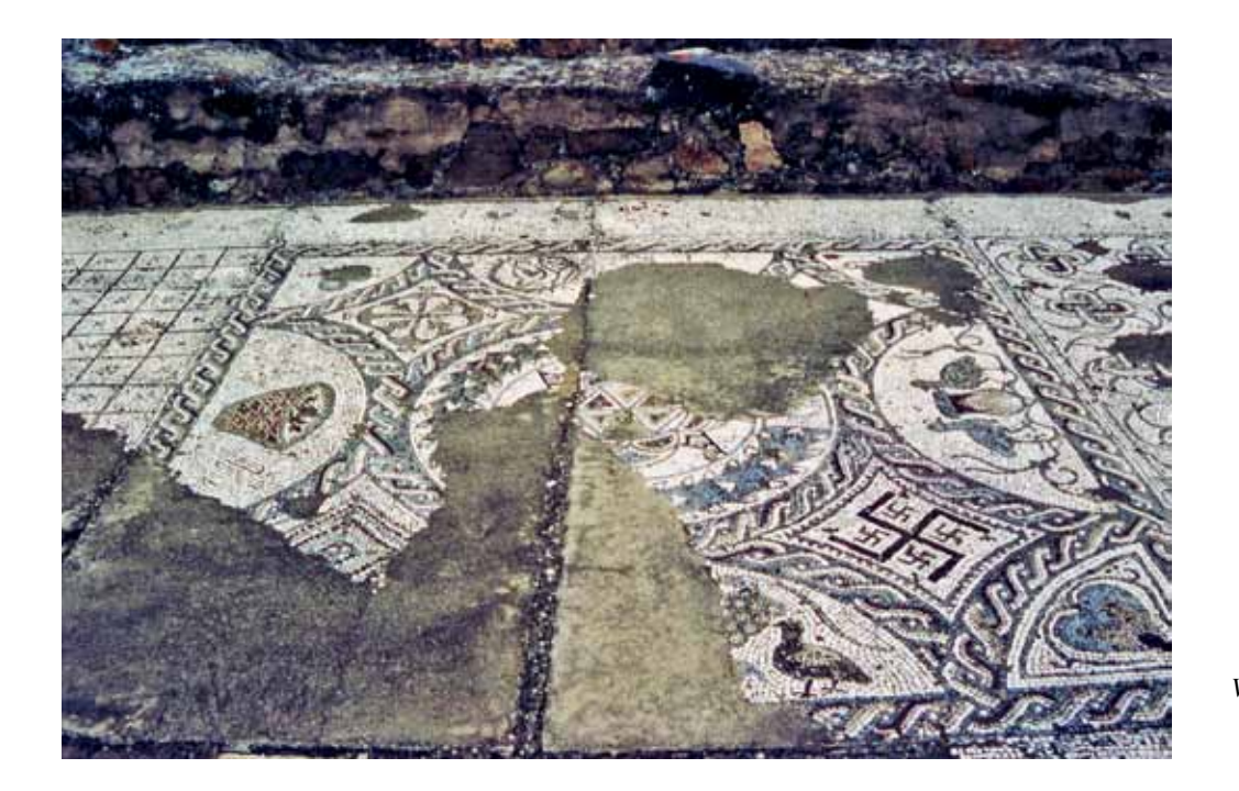
Figure 2 Mosaic panel from a room of the Villa of Pisões, Beja, Portugal.