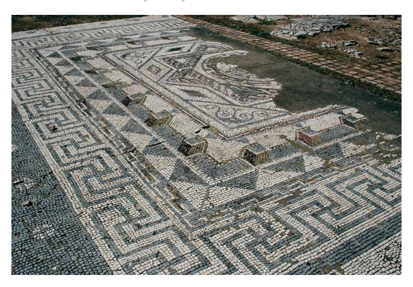
Figure 10 Mosaic pavement proceeding from Conimbriga (unknown origin).

To propose a reliable dating for the mosaic from Bracara Augusta , important archaeological data are missing out. However, the stylistic analysis and some comparisons found, either inside or outside the Portuguese territory, it appears that overall, these achievements point to 3<sup>rd</sup> and 4<sup>th</sup> centuries A.D. Considering that Bracara Augusta these centuries had a significant phase of constructive development as capital of Gallaecia (Martins et al. 2012: 57), we suggest this timeline to complete this mosaic.