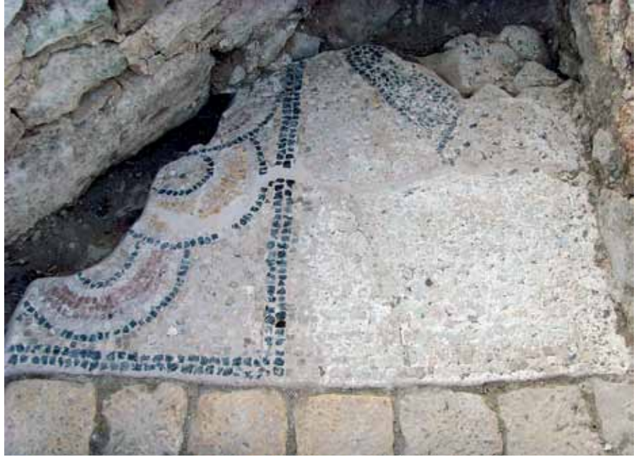
Fig. 29 Conservation Work on the Mosaic from Asar Island