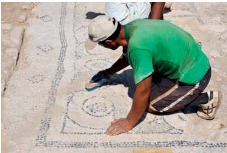
Fig. 13 Restoration Work on the Mosaic from Asar Island