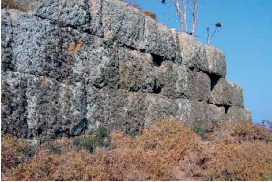
Figure 4 Myndos city wall from 4 th century