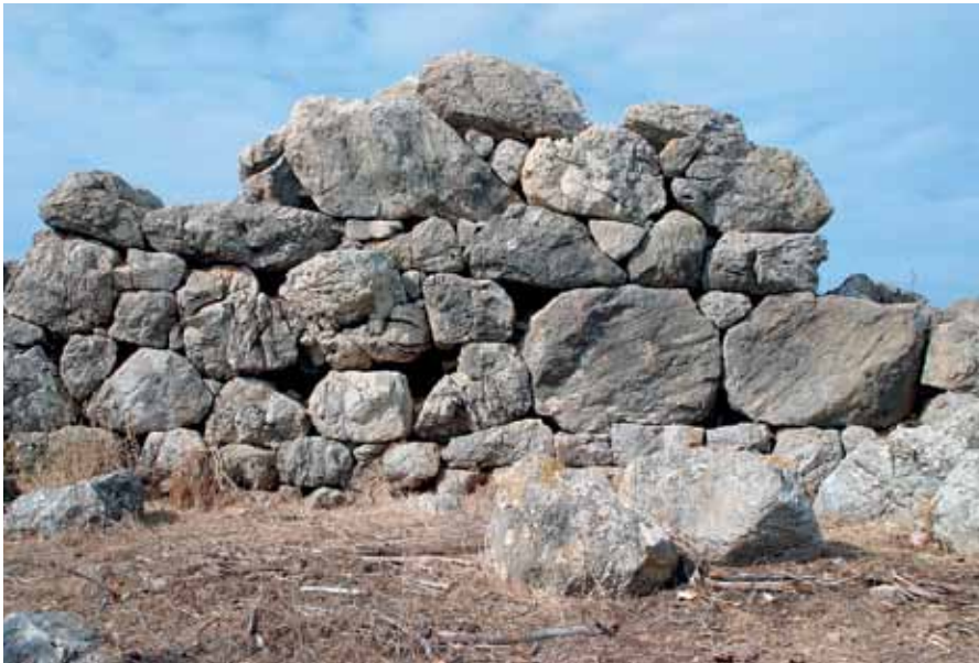
Figure 5 Lelegian Walls

was spread over a wide area. Myndos could have been a defense station for the capital city Halikarnassos against enemies, who could come from the west. The strategic location could be the reason that the city continued to develop in even the Roman period. Myndos and its harbor were protected by a city wall 5 km in length (Fig. 3). The city wall was designed in such a way that the harbor was preserved. The harbors were built so that they would protect against the northwest wind. The little island (Tavşan Adası / Rabbit Island), where the west city walls meet, is at the beginning of the connection with the mainland (Fig. 3). The traces of the preserved city walls confirm this. The city fortifications, which surround the city and are made of granite, were made with a pseudo-isodomic technique.