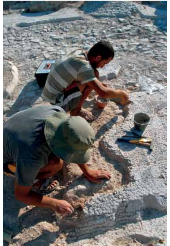
Fig. 11 Restoration Work on the Mosaic from Asar Island