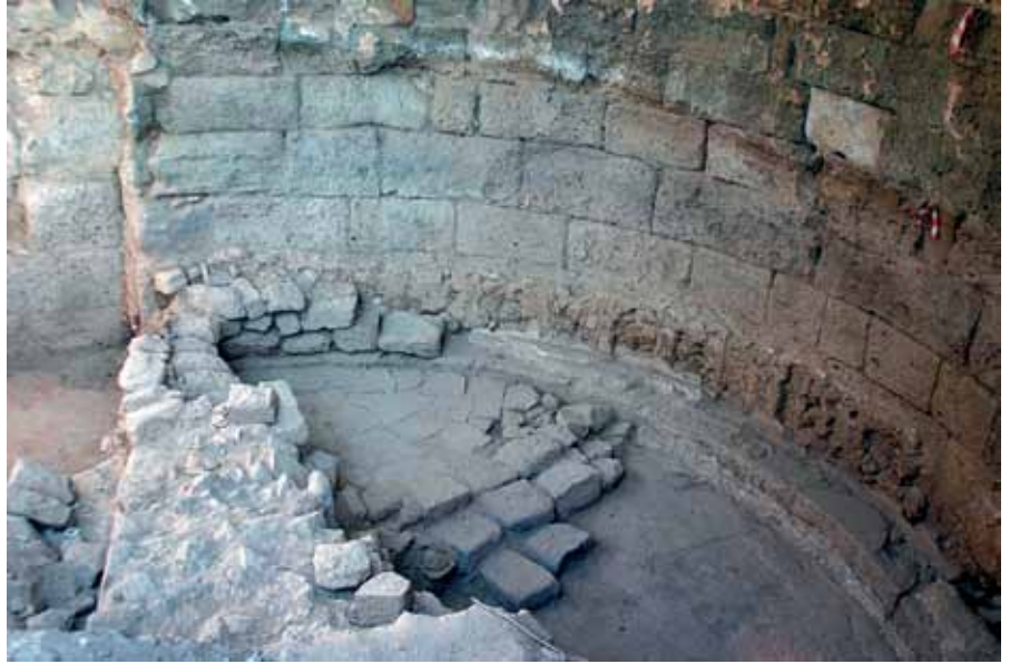
Figure 6 The Bath (Myndos Excavation Archive)

wall is similar to the city walls of Tiryns, which are dated to the second half of the 2 nd millennium B.C.. This dating corresponds with Strabon's account and confirms that the foundation of the city has to predate Mausolos.