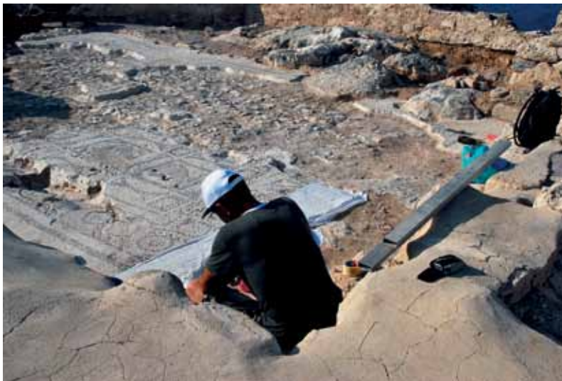
Fig. 12 Restoration Work on the Mosaic from Asar Island