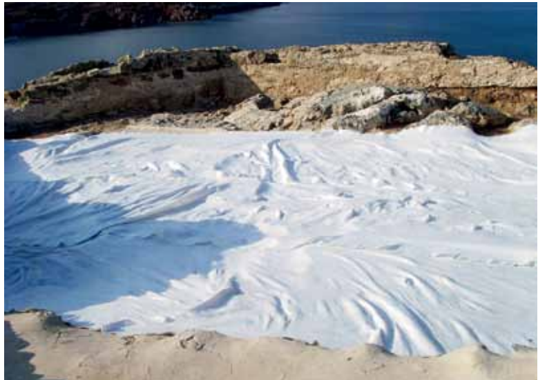
Fig. 30 Conservation Work on the Mosaic from Asar Island