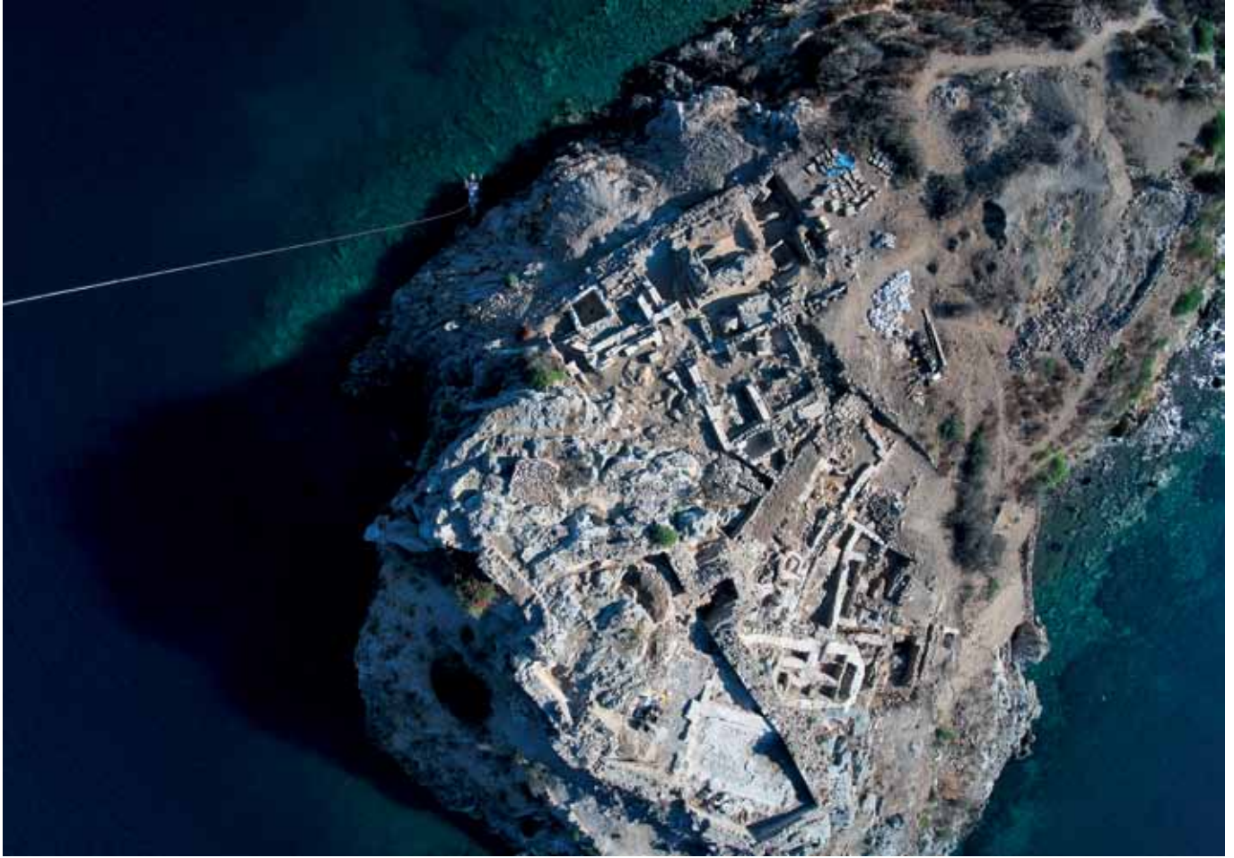
Figure 7 General view of Asar Island