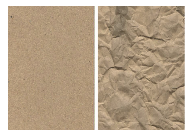
Image 1. The first image (on the left) of the scanned Kraft paper (brown paper) with the image scanner, and the transformation into a different form with external intervention (the image on the right)

ments such as lines, tones, colors, and shapes. For example, the visual texture of a wall may vary based on the cracks and indentations on its surface. Visual texture plays an important role in artistic and design expressions. Especially in children's book illustrations, visual texture can be an element that attracts a child's attention and encourages them to explore.