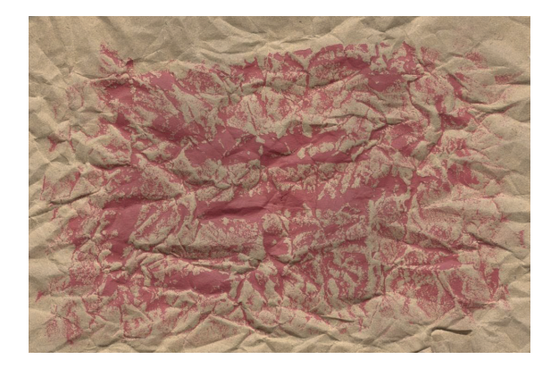
Image 2 . A new texture has been obtained by applying red acrylic paint to crumpled kraft paper.

In image 2, as seen, the texture obtained from brown paper has been changed by external intervention. It is also possible to obtain different textures from the textures themselves. This can be used to create diversity and creativity in design. For example, changes can be made to the texture using different colors and tones, giving the texture a new visual expression. In image 2, a different texture is obtained by adding some paint to this texture.