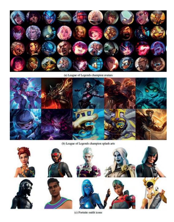
Figure 6. Random examples for each trained model.