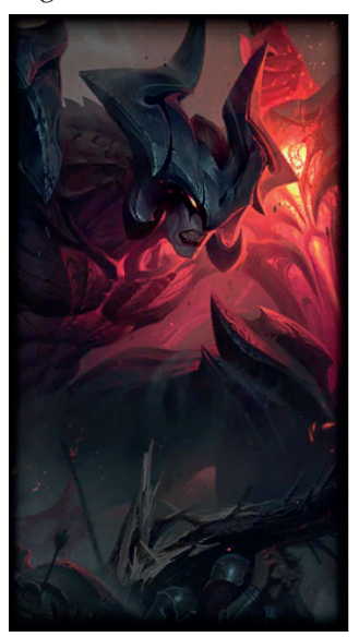
Figure 4. League of Legends Champion Loading Image.

First approach was downloading another set of champion images called loading images. These images are basically cut-outs that focus around the whole body of the character. An example of loading image can be seen in Figure 4. After acquiring these loading images, OpenCV [1] library was used to template match all of these loading images to their corresponding splash images to find a character body center point in splash images. And using the center point values, the splash image was cut in the defined window size around the center point. Doing a relatively similarly centered dataset, but for some of the images template matching failed finding the center point. These images were removed from the data set and although the remaining images looked well centered their faces didn't align with the other images in the dataset most of the time.