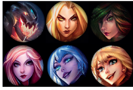
(a) League of Legends champion avatars

Looking at the outputs of each trained model both handpicked at Figure 5 and random at Figure 6, it is obvious that the worst performing one is the League of Legends champion splash arts based one. And it seems like the Fortnite outfit icons is the best performing one even though it didn't have the time to train as much as others. It looks like the reason behind Fortnite one being the best is the data set being way cleaner, all the faces are almost aligned at the same place and the background is plain white.