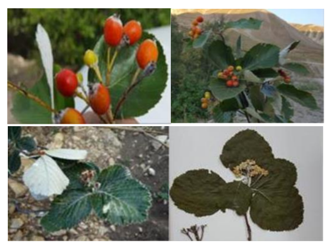
Figure1. Flower, Fruit and Leaf Forms In S. persica, S. subfusca and S. umbellata var. cretica Species