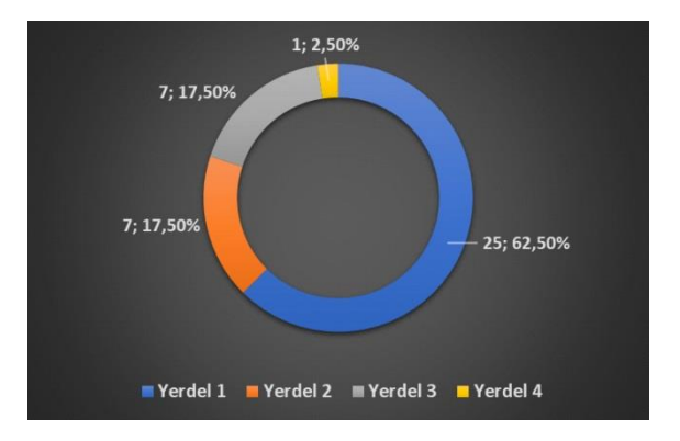
Figure 1. The distributions of the patients according to the Yerdel classification (n=40)

portal vein was dissected until the confluence of the splenic vein and superior mesenteric vein, particularly if there is stricture and it is not possible to provide patency by thrombectomy. The strictured segment was removed and replaced by a cadaveric iliac vein graft previously harvested and kept at -80 Celcius degree. The graft was anastomosed to the confluence for portal vein reconstruction. In cases without portal vein stenosis but inadequate portal blood flow, venography was performed perioperatively, and procedures such as balloon dilatation (to the splenic vein or superior mesenteric vein) or thrombectomy were performed as necessary. The portal flow was assessed after these procedures to ensure optimal portal perfusion.