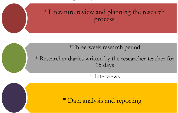
Figure 1. Research process

The narrative analysis (as a method) approach has been adopted in order to deal with the process in depth and multidimensionally in the study. In this context narrative research method was used. Narrative research, one or more It is the type of study that allows the presentation and research of experiences or individual experiences (Cohen et al., 2018). In order to achieve the aims stated in the narrative research, the interview and document analysis techniques frequently used in research has been used. Salmon (2008) argues that narratives connect experiences and thoughts and organize random and scattered discourses. In addition, the narrator makes sense of experiences and phenomena and makes associations (Riessman, 2008). The subject of narrative analysis in this research is the assessment of mathematics teacher's experiences, who teach using micro learning in an e-learning environment. In this context, researcher diaries and interview records were analyzed in document forms based on concepts and opinions to provide in-depth information and describe the situation in the current study. The researcher's diaries were prepared by the mathematics teacher who conducted the research and took an active role in the application, who is also studying for a Ph.D. In addition, semi-structured interview records with the same researcher were also included in the research as information and documents and were examined in detail. Figure 1 presents the schematized research process.