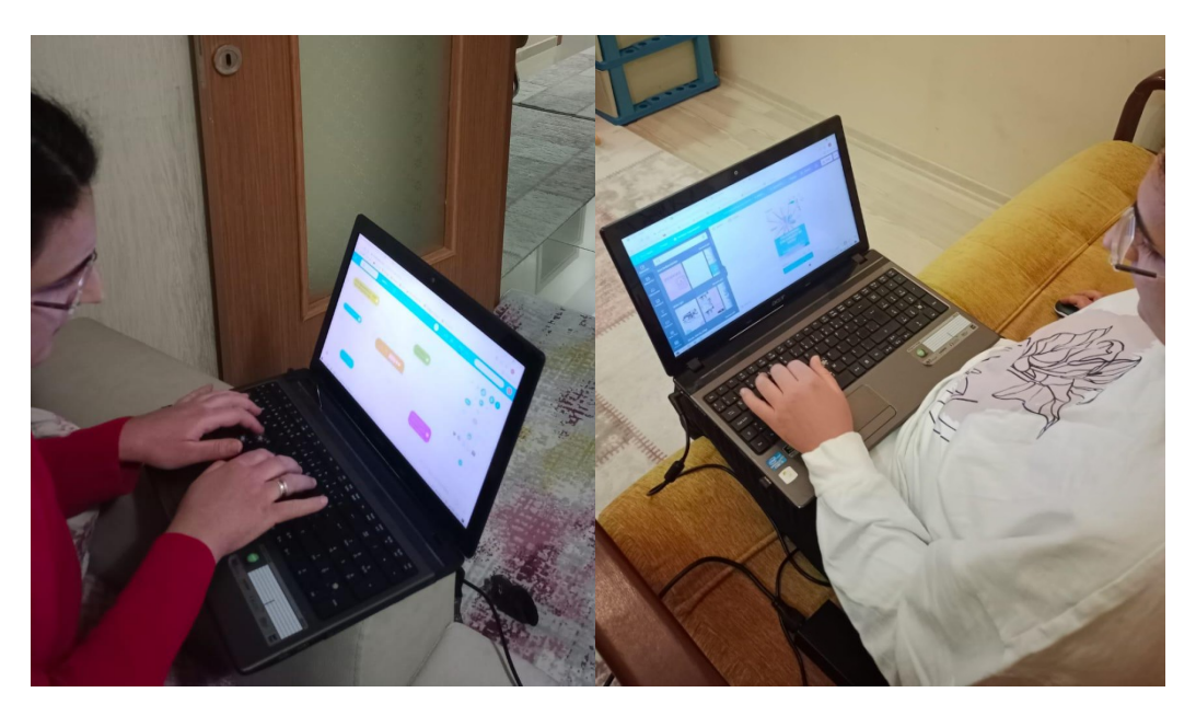
Figure 3. Micro-content preparing process