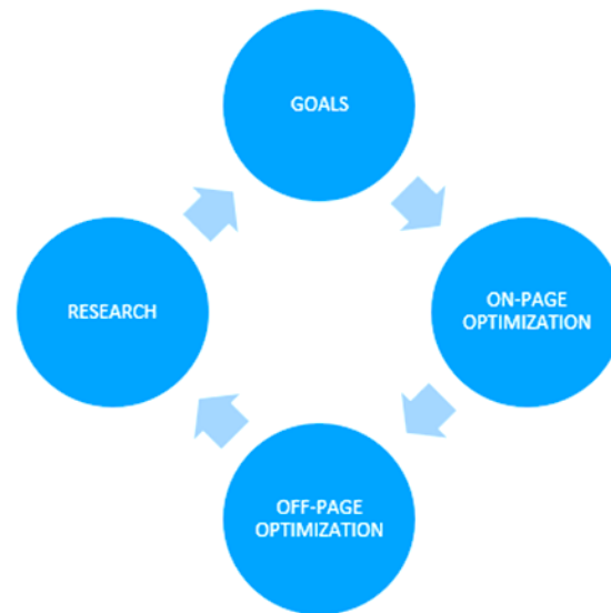
Fig. 1: Four-step process of SEO-optimization