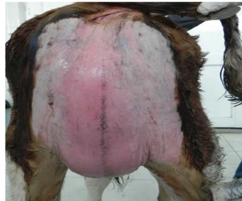
Figure 1. Out view of the the calf: swelling between perianal and scrotal area.

distinguishable from the surrounding tissue. It was also connected to the penis tissue. At the end of the surgery, a continuous flow of urine from the catheter was observed. As the catheter was removed a week later, no urine flow from the anus was observed. Therefore, successful urination from urethra was seen to be accomplished as a result of the surgery (Figure 5).