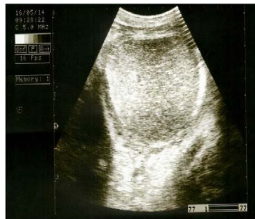
Figure 3. Note the dilated urethra in ultrasonography.