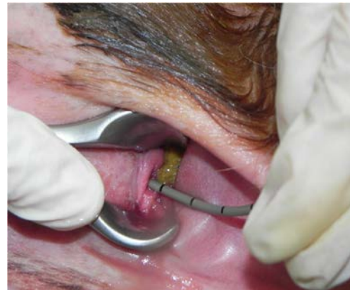
Figure 2. Determination of the rectourethral fistula.