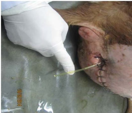
Figure 5. Postoperative view of the calf.