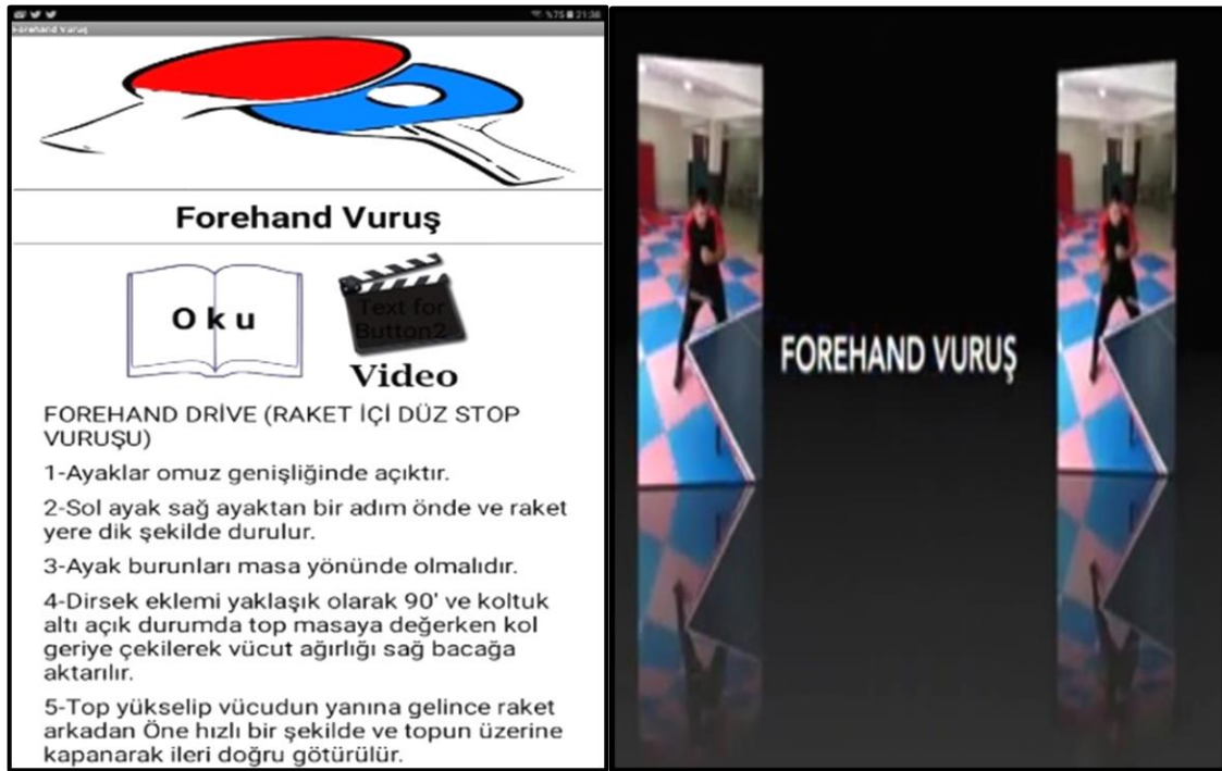
Figure 3. Table tennis basic skills mobile learning program forehand, stroke display image.