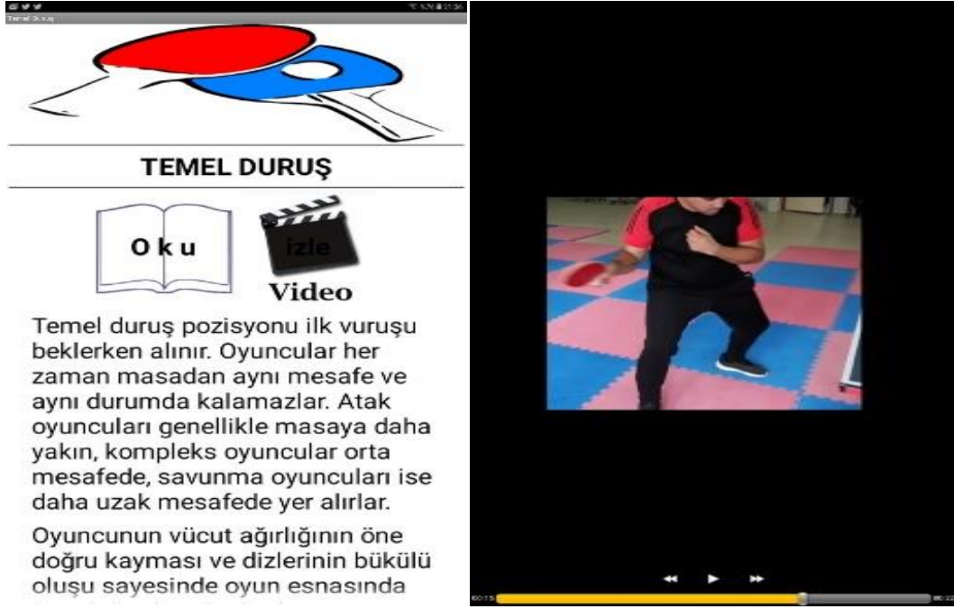
Figure 2. Table tennis basic skills mobile learning program basic posture display image.