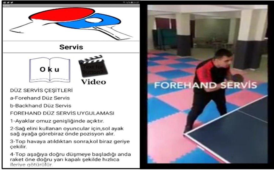
Figure 4. Table tennis basic skills mobile learning program serve display image.