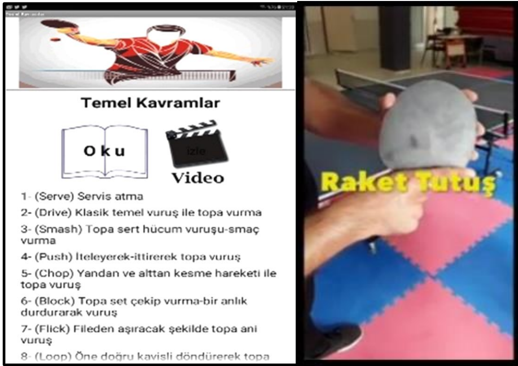
Figure 5. Table tennis basic skills mobile learning program basic concepts and racket grip display image.