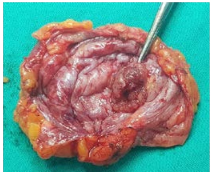
Figure 3. Excised cystic intraductal polypoid lesion.

While papillary neoplasia constitutes 40-70% of pathological nipple discharges, bloody or pathological discharge is observed in only half of the patients diagnosed with papilloma. Papillary carcinomas are rare and account for 1% to 2% of all breast malignancies. It is frequently seen in the postmenopausal group, and complaints of palpable mass and nipple discharge are present [13]. In our case, there was postmenopausal age but no nipple discharge. The absence of this finding was a feature that strengthened the benign character of the lesion. Cysts containing papilloma are smaller in size than papillary carcinoma, and intracystic papillary lesions smaller than 3 cm are usually