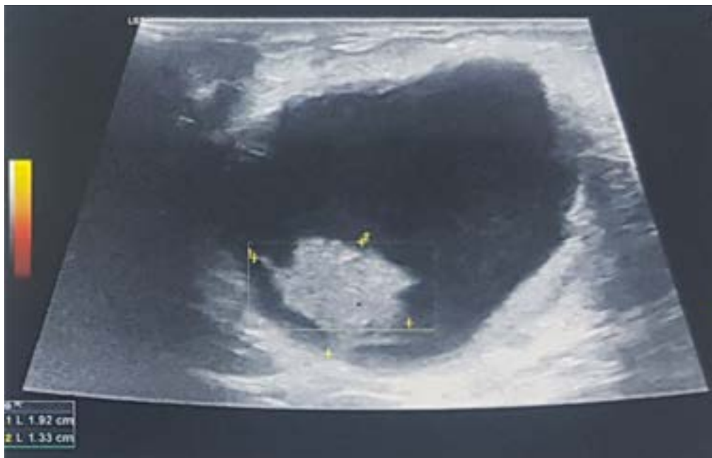
Figure 1. Ultrasound image of a complex cystic mass lesion

Nipple retraction, discharge and palpable breast stiffness are the main complaints that cause patients to worry and apply to the hospital. As a result of the frequent use of imaging methods such as mammography or ultrasonography in breast cancer screening, papillary lesions can be detected as an asymptomatic mass or calcified lesion [8]. US findings in papillary breast lesions depend on the macroscopic appearance of the lesion [9]. On US, papillary lesions can be seen