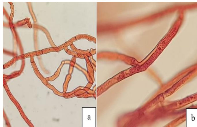
Figure 2. The appearance of the nuclei stained with Safranin O in light microscopy: (a) Multinucleic nucleus (MN), (b) Binucleic nucleus (BN)

9 out of 10 isolates of R. solani obtained from beans, 14 of 15 isolates obtained from potato, and 14 of 15 isolates obtained from sugar beet were determined as multinucleate. It was determined that 1 isolate isolated from the bean, sugar beet and potato was binucleate. As a result, a total of 37 multinucleate (MN) and 3 binucleate (BN) isolates were obtained from all plants.