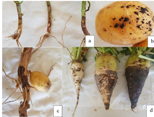
Figure 1. Symptoms of R. solani in different plants: (a) beans; (b-c) potato; (d) sugar beet

To determine the number of nuclei of the isolates, which were microscopically found to be R. solani , staining was performed with safranin O (Figure 2).