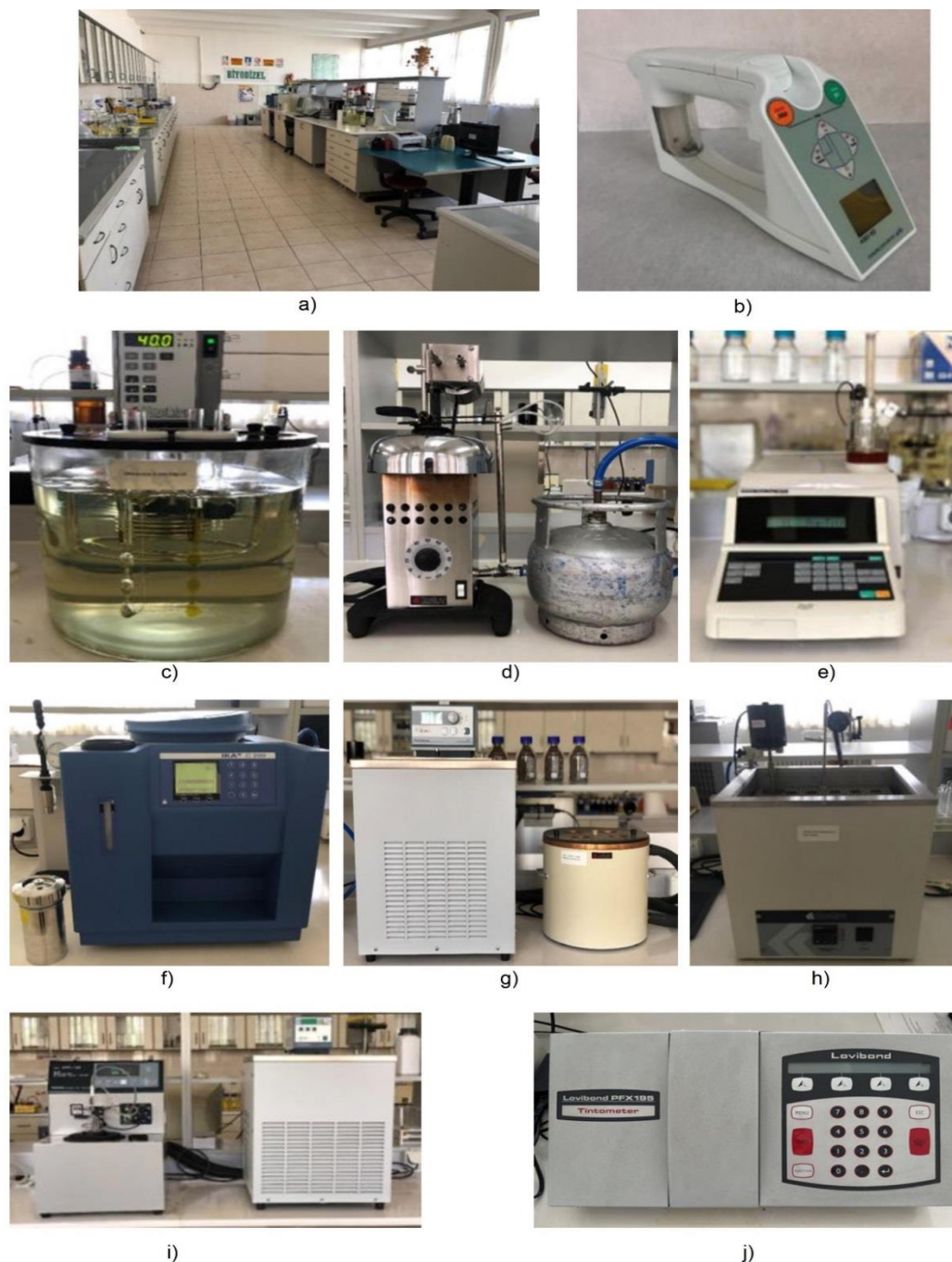
Figure 1. The devices and laboratory used in fuel analysis

The present study outlines the procedures undertaken to produce biodiesel from safflower crude oil and refined safflower oil. The transesterification method was employed in a two-stage process, utilizing a magnetic stirrer with heater at the Biofuel Laboratory of the Department of Agricultural Machinery and Technologies Engineering, Faculty of Agriculture, Selçuk University. The devices and laboratory used in fuel analysis are given in Figure 1. These measurements were made according to the device and working methods given in Table 3.