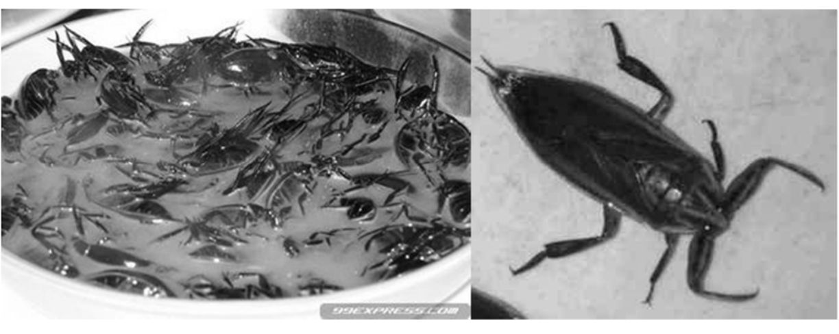
Figure 3. a) A traditional soup made from water scorpion. b) Water scorpion.