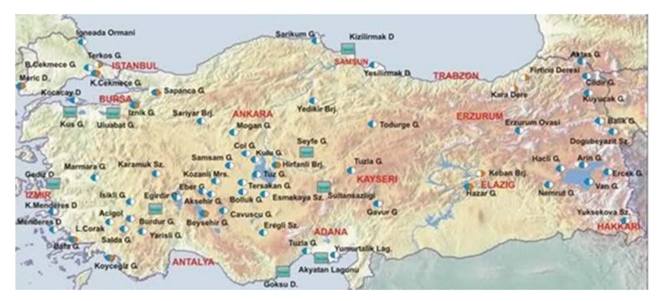
Figure 1. Wet lands of Turkey

Turkey has rich wet lands and their aquatic beetles fauna relatively (Kakman et al. 2003; Darılmaz and İncekara 2011; Darılmaz and Salur 2015; Darılmaz et al. 2016; Kazancı and Türkmen 2012). With this study, aquatic insects as alternative protein sources in the wetlands of Turkey (Figure 1) attract the attention.