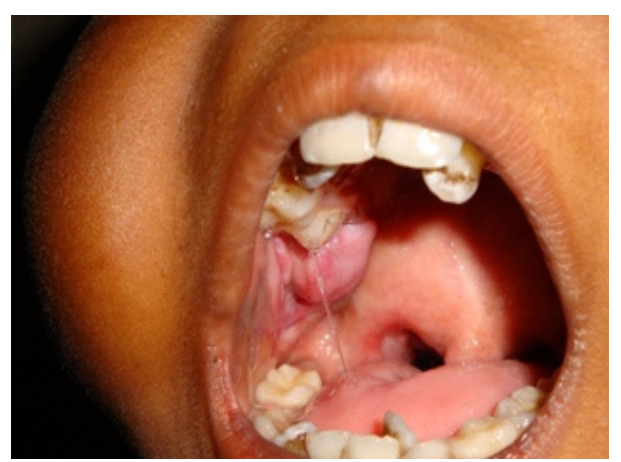
Figure 1: Clinical photograph of the submucosal swelling in the posterior maxillary alveolus.