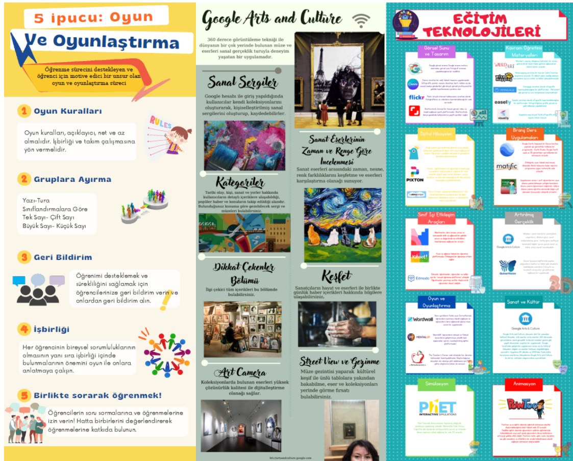
Picture1 Some of the infographics designed during the education process

This shows that the subject's content can affect the preparation of the infographics. Since the fourth project is related to culture and art, its rich content and visuality affected the infographic quality. In the last project, the infographics including all the subjects in the education process similarly caused the highest score to be obtained due to the richness of the content and the increase in the experience on this subject (Picture 1).