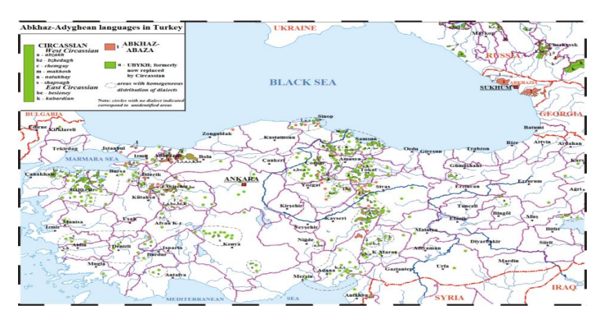
Figure 2: Map of Circassian Speakers in Turkey (Caucasian Languages in Turkey n.d.)