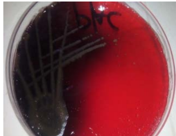
Figure 1. Colony morphology of Listeria in PALCAM agar

Figure 1 shows the black sunken centre and a black halo on a cherry-red background, following aesculin hydrolysis and mannitol fermentation of a typical listeria characteristics. Table 1 shows the result of the fried fish, working slab and tools samples examined for L. monocytogenes . Out of 2400 fried fish, 800 working slab and 800 tools examined, 528 (22%), 313 (39.13%) and 195 (24.38%) were positive for L. monocytogenes respectively. About 25.90% of the total samples examined were infected with L. monocytogenes .