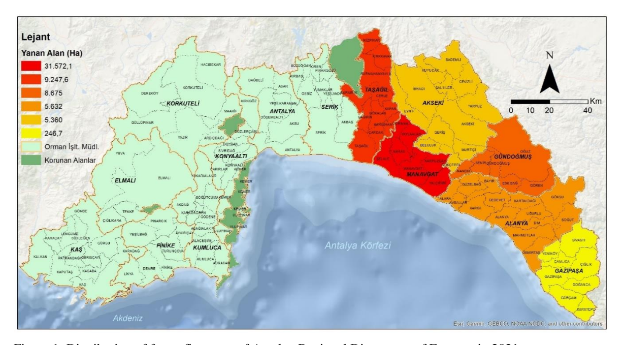
Figure 1: Distribution of forest fire areas of Antalya Regional Directorate of Forestry in 2021

Considering global climate change, there is a risk that these and similar abnormal natural events will occur more frequently in the future. For this reason, forest villagers living in close proximity to forest areas may be affected even more severely. According to the investigation in the study area, the list of villages affected by forest fires in the Manavgat district is given. The ways of being affected are categorized as "Villages highly affected by fire," "Villages affected by the fire with moderate damage," and "Villages less affected by fire" (Table 2).