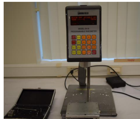
Figure 5: Brookfield Viscometer

The viscosities of the coatings are measured at room temperature using a Brookfield Viscometer (Figure 5), #4 spindles, at 100 rpm. The adjustments of the viscosity are made with a 3% solution of carboxymethylated cellulose (CMC) solution (by weight), until a Brookfield viscosity of approximately 1,200 cps is achieved.