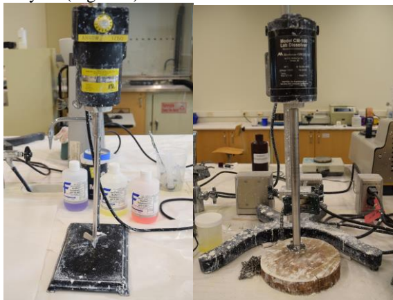
Figure 3: Arrow 1750 Three-Blade Mixer and Cowles CM-100 Lab Dissolver

Arrow 1750 Three-Blade Mixer is used to mix and then Cowles CM-100 Lab Dissolver is (Figure 3) used to disperse materials. The target solids of the coatings are 55% and are measured on the CEM Smart Solids Analyzer (Figure 4).