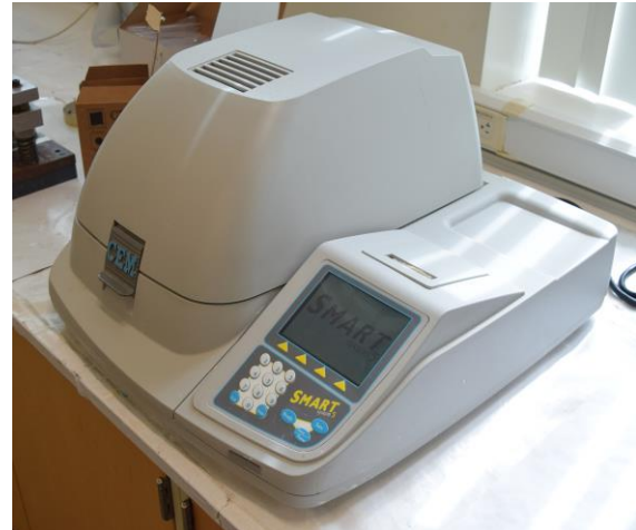
Figure4. CEM Smart Solids Analyzer

The solids of the coatings are measured after all adjustments to pH and viscosity are done. The pH of coating is adjusted using solution of ammonium hydroxide solution (NH 4 OH) to increase and sodium hydroxide (NaOH) to decrease the pH to a target of 8.5-9.