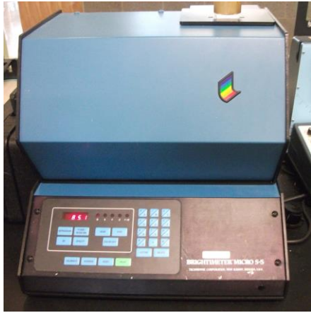
Figure6. Technidyne Brightimeter Micro S-5