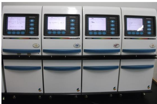
Figure8. Technidyne Profile Plus