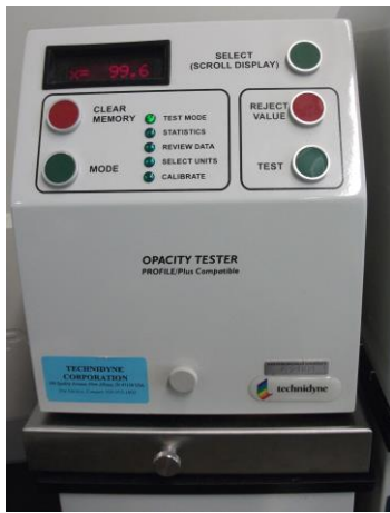
Figure7. Technidyne Opacity Tester