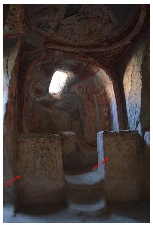
Figure 18: Ihlara Sümbüllü Church, curtain motifs on templon (M. Kaya, 2016)