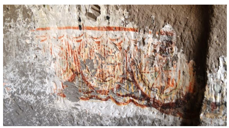
Figure 7: Başköy Basileos (Kapalı) Church no. 10, part of a mural of north apse (M. Kaya, 2016)