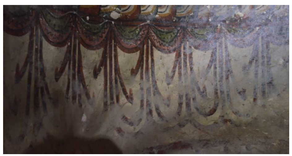
Figure 12: Ihlara Yılanlı Church, apse