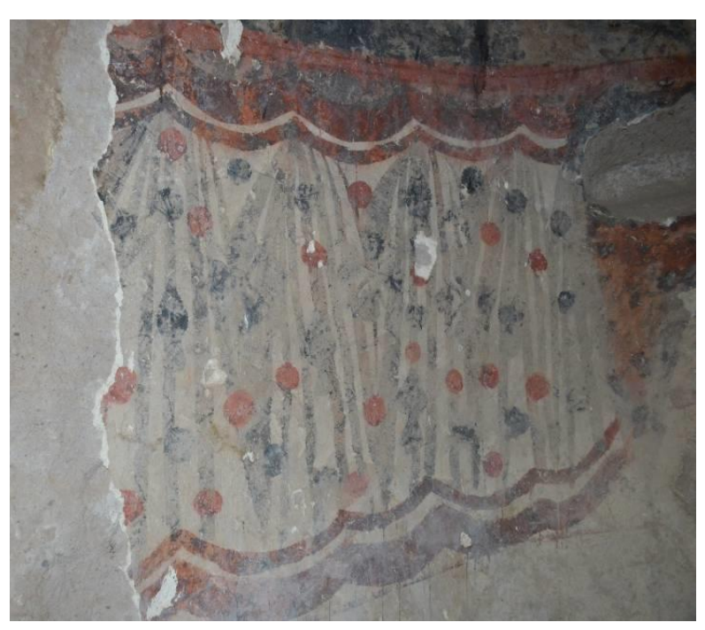
Figure 14: Belisırma Direkli Church, the lower part of main apse (M. Kaya, 2017)