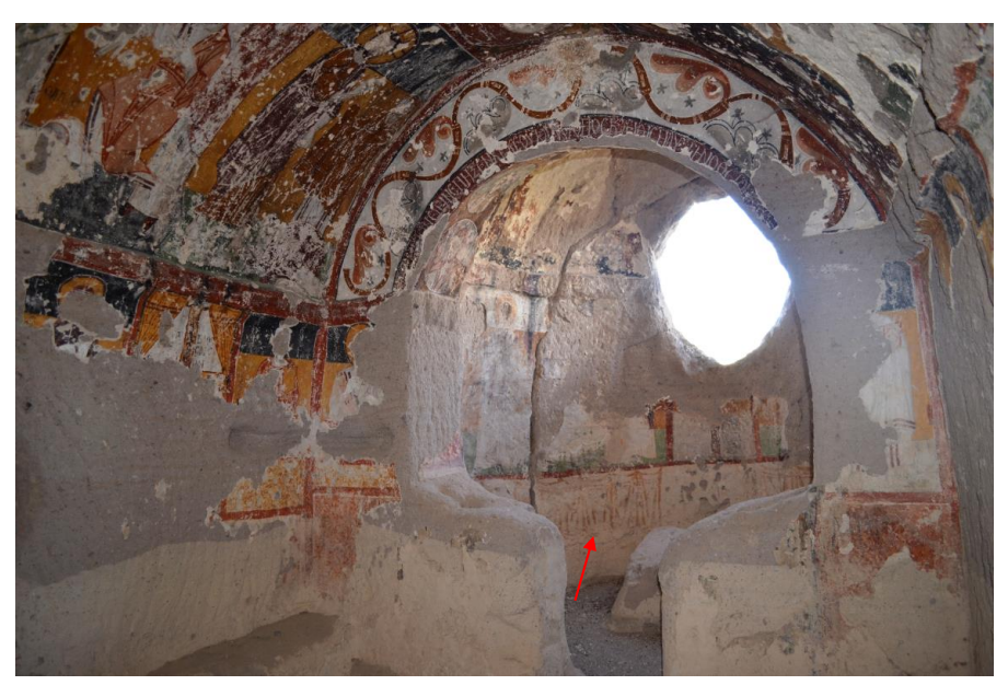
Figure 5: Belisırma Açıkel Ağa (Batkın) Church, looking toward the apse