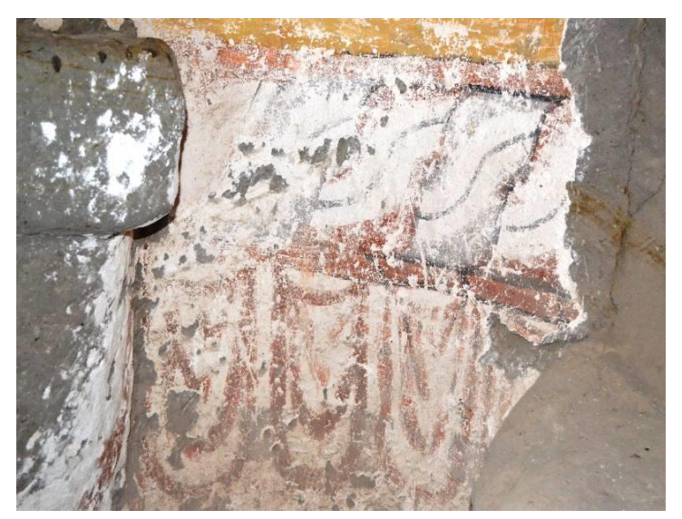
Figure 11: Ihlara Pürenliseki Church, north apse imitation curtain detail (M. Kaya, 2016)