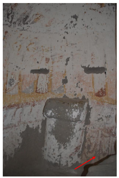
Figure 10: Ihlara Pürenliseki Church, north apse (M. Kaya, 2016)