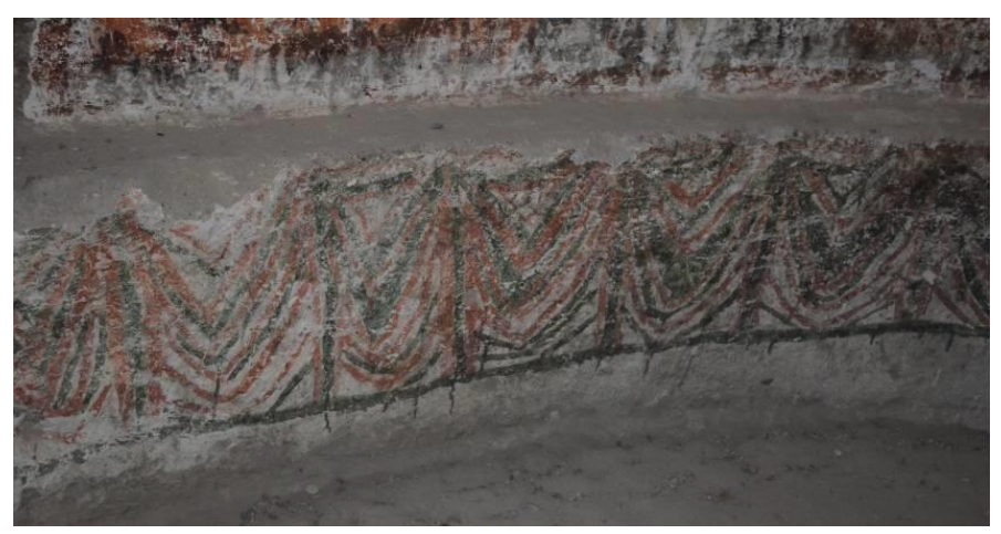
Figure 15: Soğanlı Karabaş Church, apse (M. Kaya, 2017)