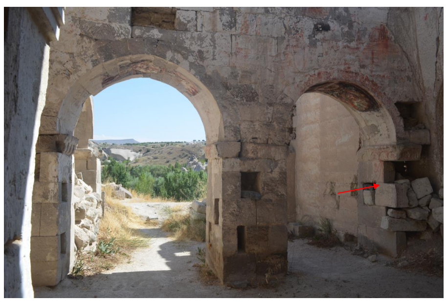
Figure 16: Timos/Tavros Stavros Church, central nave, looking south