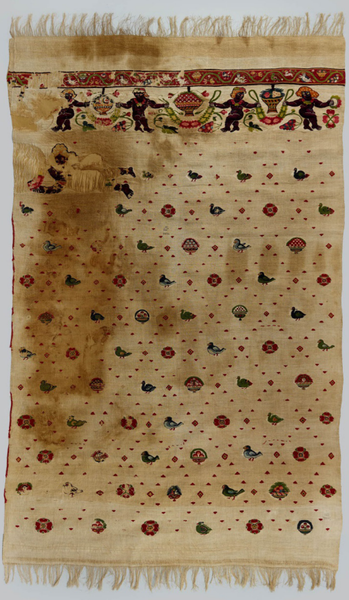
Figure 1: An original Byzantine curtain example from the Monastery of Saint Demyanah, Egypt (5th century), (Stephenson, 2014, fig.13)

Figure 2: An original Byzantine curtain example from Egypt (6th -7th century), The British Museum https://www.doaks.org/resources/textiles/images/ maguire-images/maguire-fig02.jpg accessed 10.05.2023