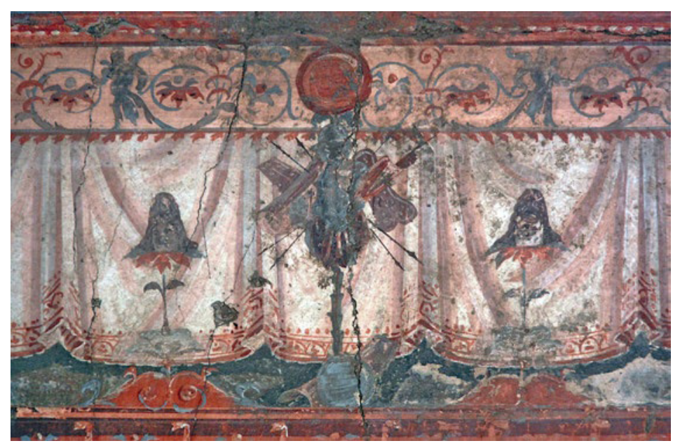
Figure 4: Imitation curtain patterns in the upper part of the western wall of room six of the Roman house structure Casa del Gran Portal (V35) in Herculaneum (Dardenay, 2021, 112, fig.4).