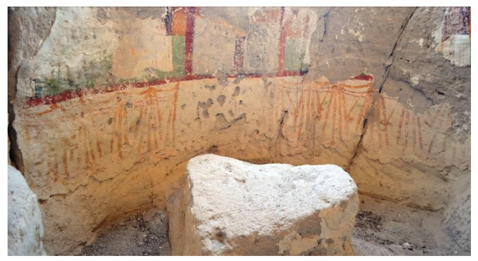
Figure 6: Belisırma Açıkel Ağa (Batkın) Church, lower wall of apse detail (M. Kaya, 2016)