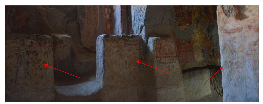
Figure 19: Ihlara Sümbüllü Church, curtain motifs on templon and south wall