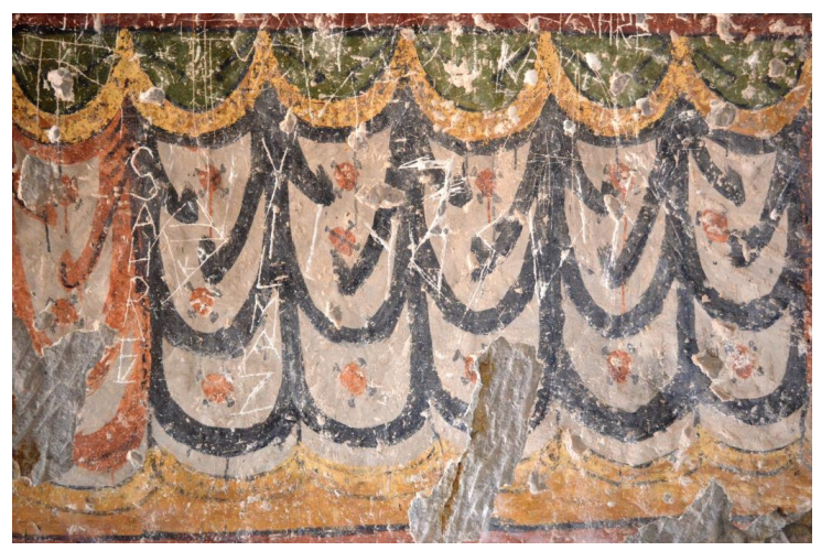
Figure 9: Ihlara Kokar Church, a view from the lower band mural on the south wall (M. Kaya, 2016)