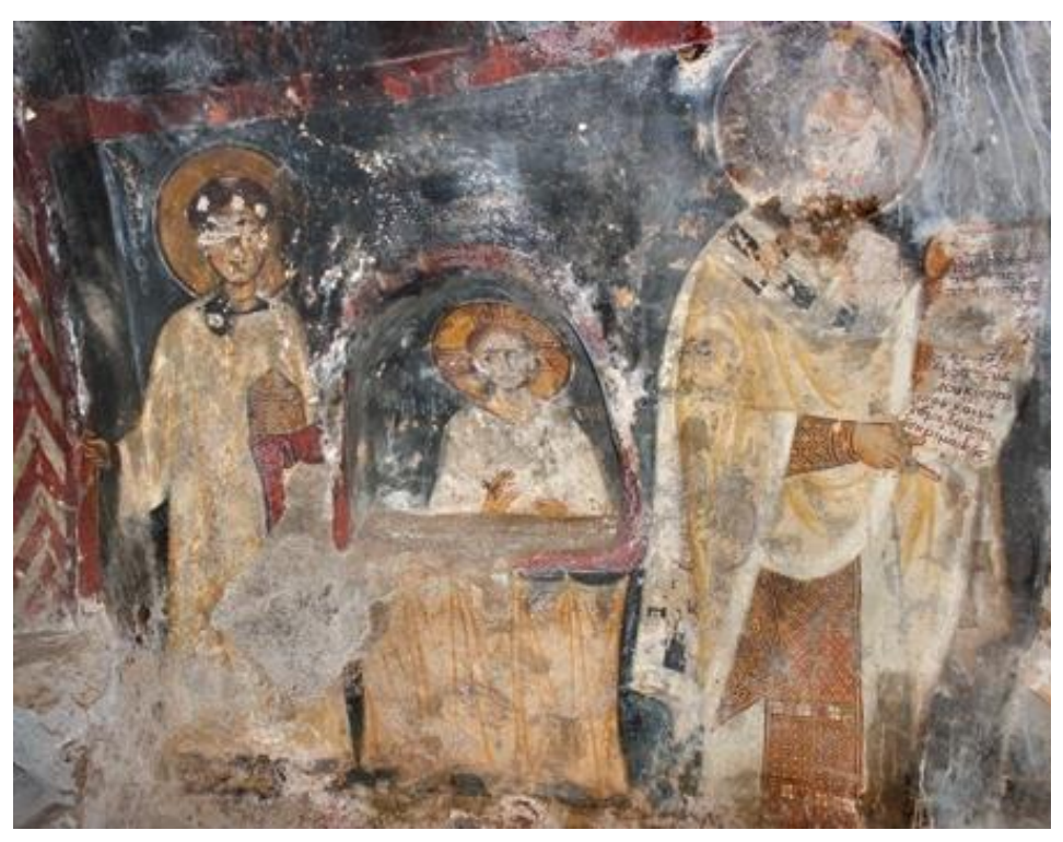
Figure 20: Ihlara Bezirana Church, imitation curtain patterns on the apse niche of the north wall (Levy, 2017, 110, fig.4)