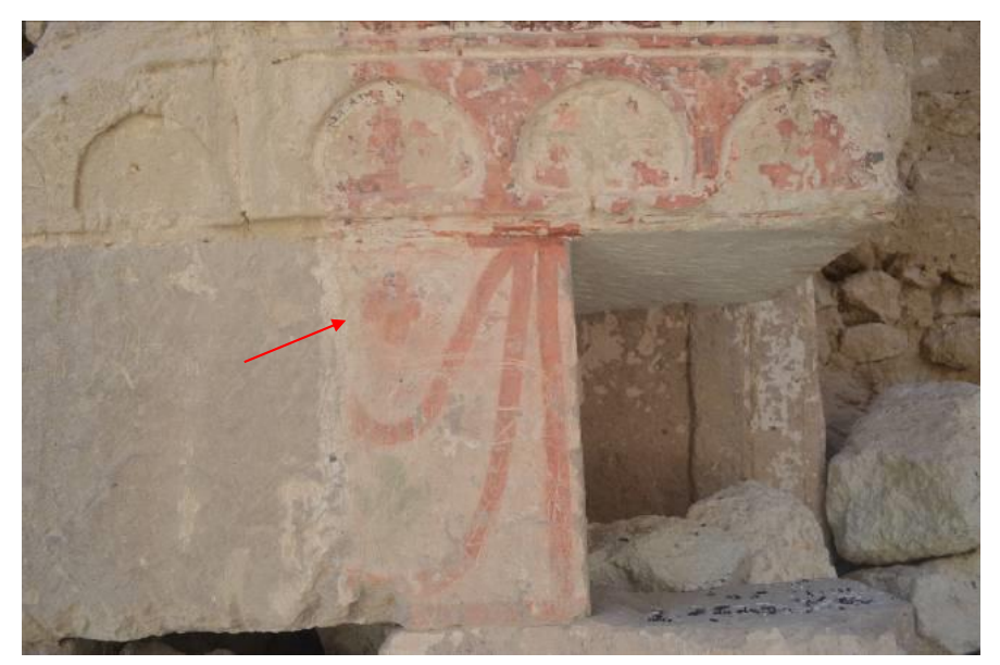
Figure 17: Timos/Tavros Stavros Church, inner surface of the southwest pier of the middle nave; a clover leaf/cross motif on imitation curtain pattern (M. Kaya, 2016)