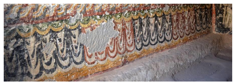
Figure 8: Ihlara Kokar Church, a view from the lower band mural on the north wall (M. Kaya, 2016)