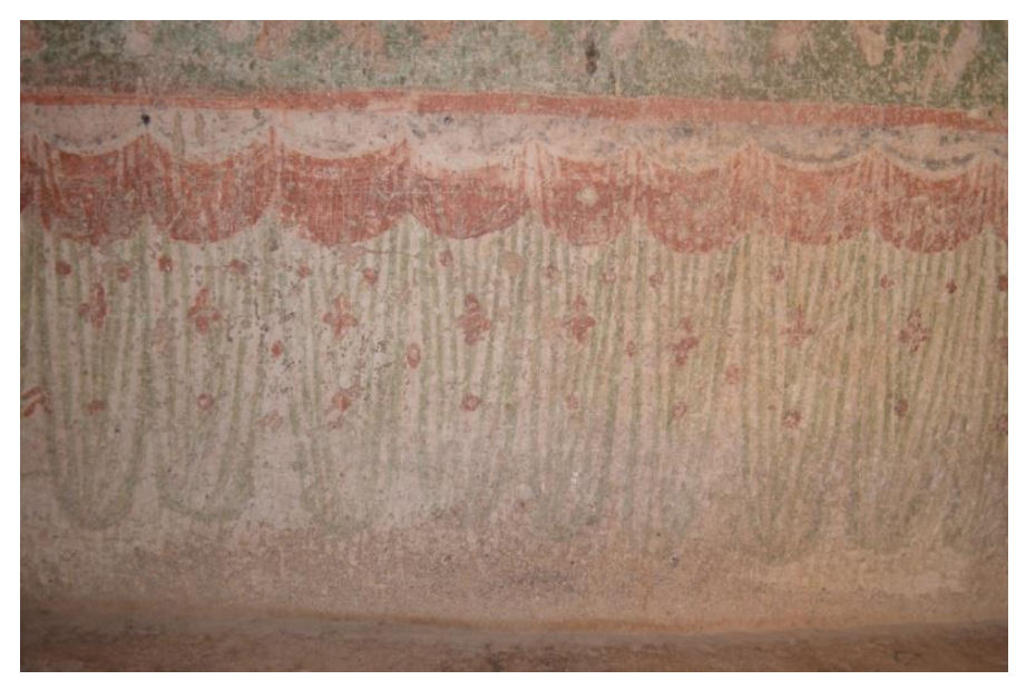
Figure 13: Çavuşin Güvercinlik Church, north wall of naos (M. Kaya, 2017)