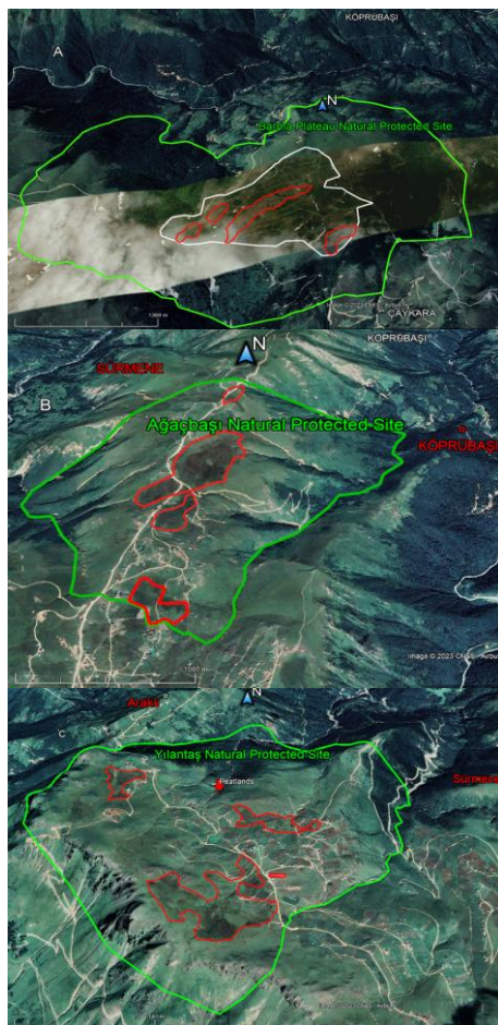
Figure 2. A-Barma, B-Ağaçbaşı, C-Yılandaş Natural Protected Sites.

The peatland areas within the natural protected areas are not a single bloc area. There are 4 peatlands in Barma and Ağaçbaşı plateaus and three in the Yılandaş plateaus (Fig 2 A, B and C). In the region, apart from these areas, there are some smaller peat formation areas.