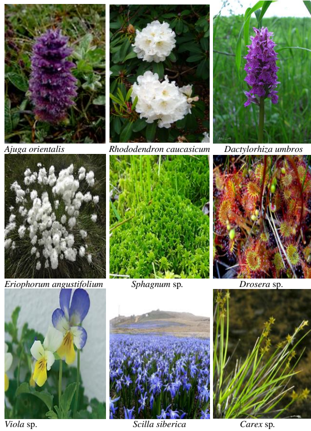
Figure 4. Some flora species of the Ağaçaş, Barma and Yılantaş peatlands and surroundings.

ensure a rich diversity for insect fauna, including butterflies (CRPB, 2015; ETBAR Ağaçaş, 2018; ETBAR Yılantaş, 2019; ETBAR Barma,2019). Other groups such as microorganisms and insects have not been surveyed systematically yet, but given the isolation of the peatland areas, it is likely that many uncommon species may be present.