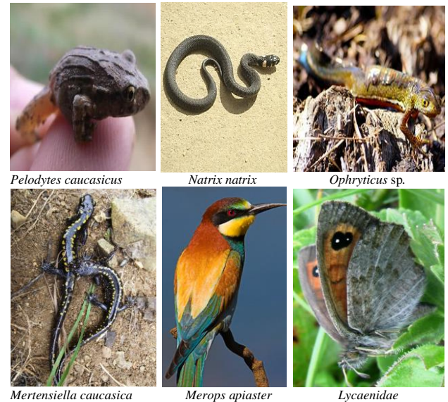
Figure 5. Some species of peatland and plateau fauna.

and reptiles (Fig 5) The plateau and peatlands are on the eastern routes of the bird migration from Europa to the Middle East and Africa. Ağaçaş, Barma and Yılantaş peatlands furthermore are valuable as an archive of historical information on the environmental features of the mires and the region.