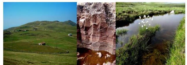
Figure 3. Ağaçbaşı peatland and peat section (Foto C. Eruz).

Ağaçbaşı, Barma and Yılandaş peatlands are ombrotrophic and receive water and nutrients primarily from precipitation (mainly rain and snow). The slope of peatlands changes between 0 % to 10%. Peat thickness varies from 50-300cm in Ağaçbaşı, 100-450cm in Barma and 50-200cm in Yılandaş (Fig 3).