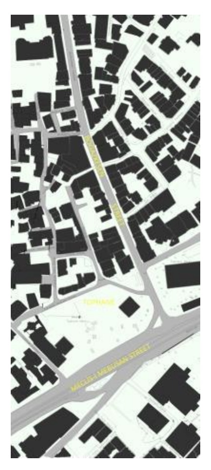
Figure 3. Masterplan of Boğazkesen Street