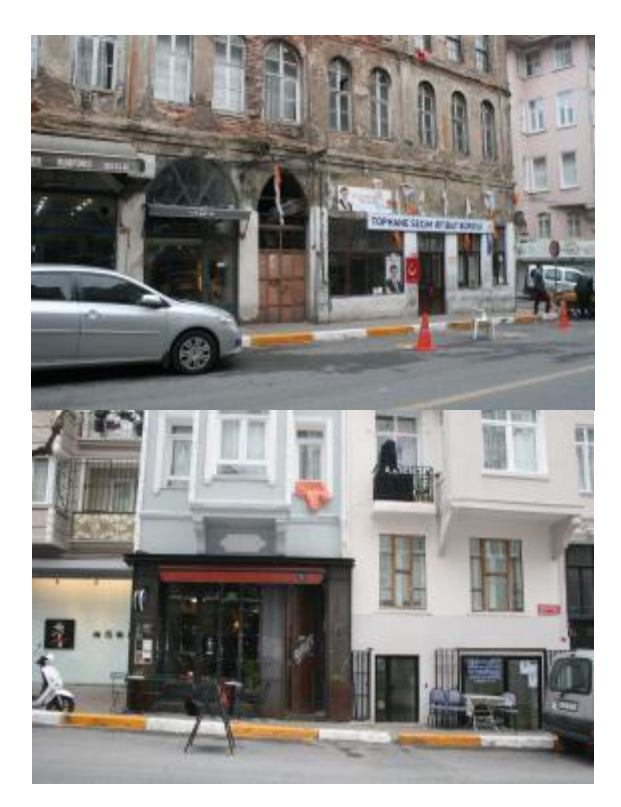
Figure 6-7. Views from the street, old and new shops together.