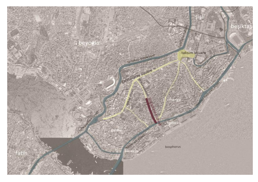
Figure 2. Location of Boğazkesen Street and its relation with Beyoğlu, Bosphorus and Golden Horn.

Boğazkesen Street is a dynamic neighborhood that has been in a transformation process since 2000s. It is located in a strategic spatial point and in the main axe of the city –in Beyoğlu, next to Bosphorus and Golden Horn, close to historical places, touristic areas, the harbor, cultural hotpots and the other areas which had already gone through the gentrification process.