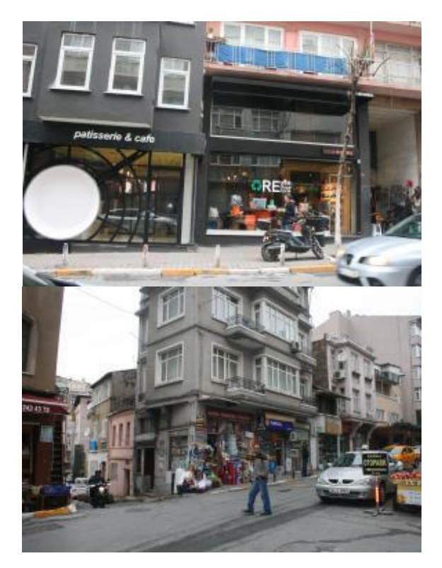
Figure 4-5. Views from the street.