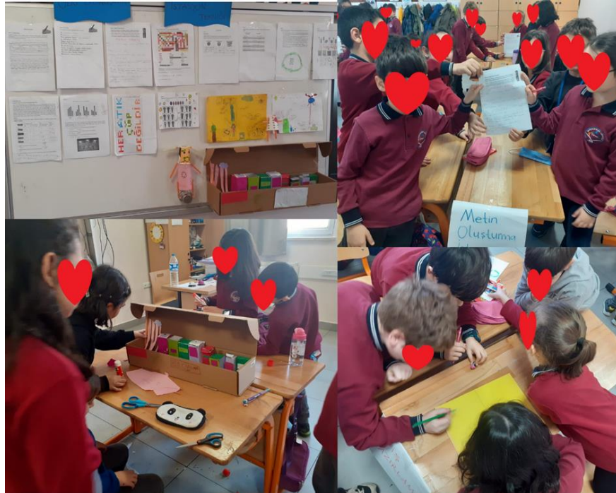
Picture 2. Application process