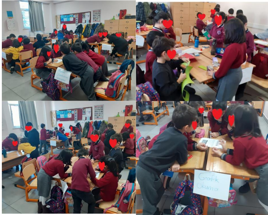
Picture 3. Application process