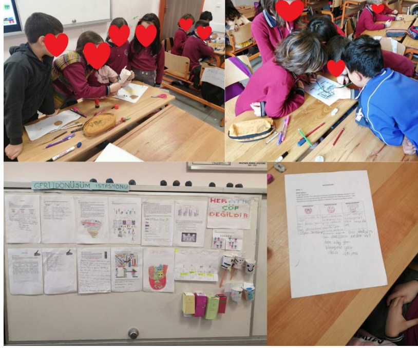
Picture 1. Application process