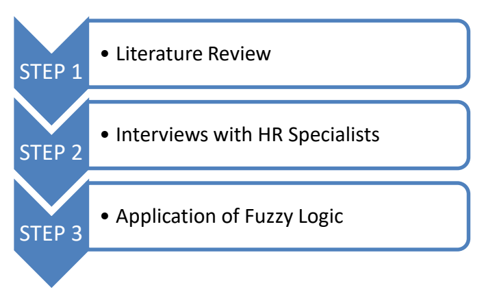
Figure 1. Steps of the Study

To achieve the research objectives and test the hypotheses, a mixed-method approach has been employed for data collection. The study will utilize both literature review and interviews with HR specialists working in airlines based in Turkey to determine the criteria set affecting HRM decisionmaking in the aviation sector.