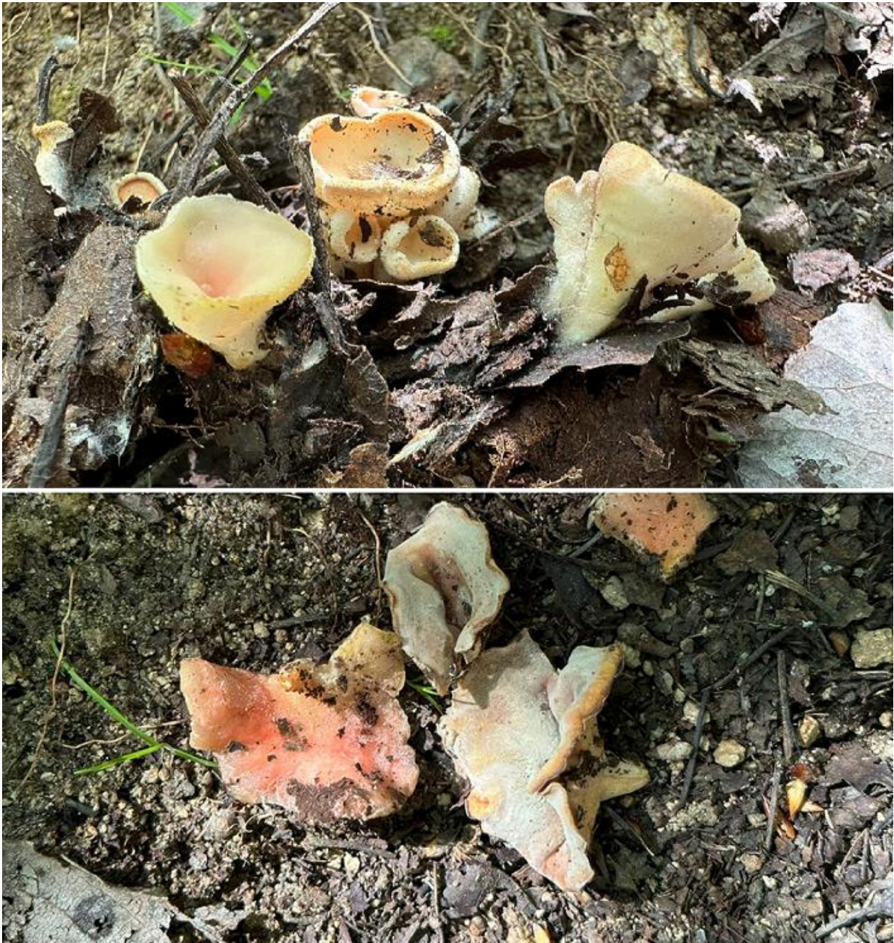
Figure 1. Ascocarps of Arpinia luteola