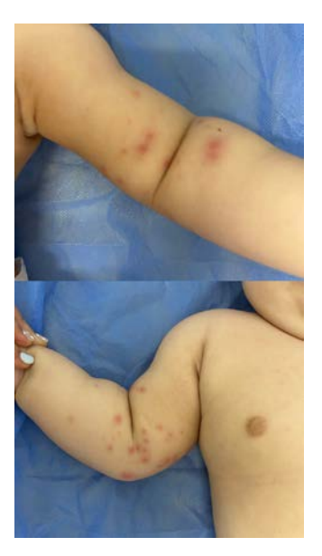
Figure-2. Case-2, spotted fever infection after Rickettsia slovaca and Rickettsia aeschlimannii coinfection.

A nine-month-old girl presented with fever and maculopapular rash and 0.5 cm lymphadenomegaly in the left axilla two weeks after a tick bite on her left arm (Figure-2). The rash was localized to the arm and no pathology was detected in physical examination or the laboratory findings. R. slovaca and R. aeschlimannii serologies were detected 1/40 positive. Tularemia, Lyme, R. conorii serologies and Rickettsia spp. PCR were negative. A rapid improvement was observed in the clinical findings of the patient under empirical ciprofloxacin treatment. Her physical examination was normal, and her rash and fever disappeared during her first week of outpatient control.