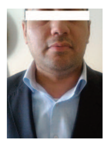
Figure 4. The edema diminished competely.

was applied. Daily dosage of per oral 100 mg acetylsalicylic acid (ASA) and 100 IU/kg subcutaneous enoxaparin sodium therapy was given. For long term anticoagulant therapy warfarin sodium was applied per oral according to the international normalized ratio (INR) adjusted level. After the removal of the catheter there has been a decrease in the swelling dramatically thus we decided to apply only medical treatment and avoid any further intervention. At discharge after three days he did not have any dyspneic symptoms more and after one week the edema on the face, neck and upper extremities was nearly totally diminished (Figure 4).