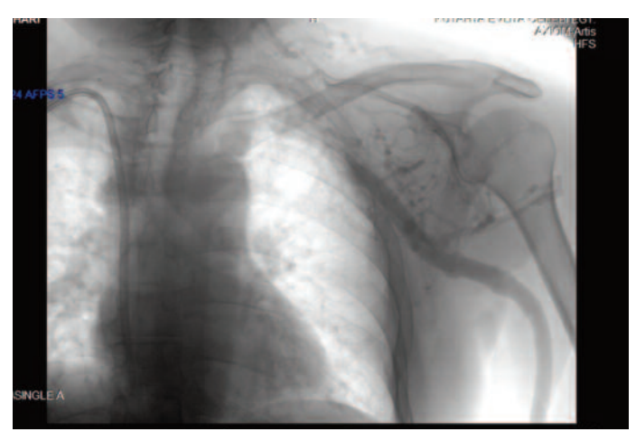
Figure 2. Permanent hemodialysis catheter, narrowed superior vena cava and presence of collateral veins.

The upper extremity veins were dilated bilaterally. He had tachypnea, tachycardia and crepitate rales at both lungs on admission. Doppler ultrasound and venography was performed. According to the doppler ultrasound findings, AVF and the related cephalic vein was patent and 272 ml per minute flow measured. However venography showed that there was a narrowing starting from right internal jugular vein and continuing to the superior vena cava, due to the permanent catheter at this side (Figure 2).